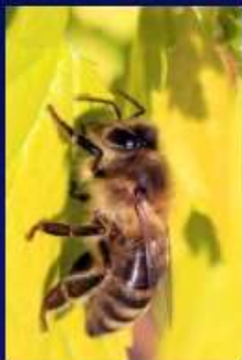
Apis mellifera

Thielens et al., Exposure of Insects to Radio-Frequency Electromagnetic Fields from 2 to 120 GHz, Scientific Reports (2018)