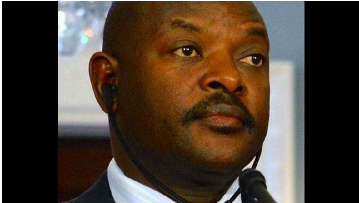
President of Burundi Pierre Nkurunziza,

Then there is the recent death of Burundian President Dies Suddenly after Expelling WHO for False Pandemic . This occurred on June 23, 2020.