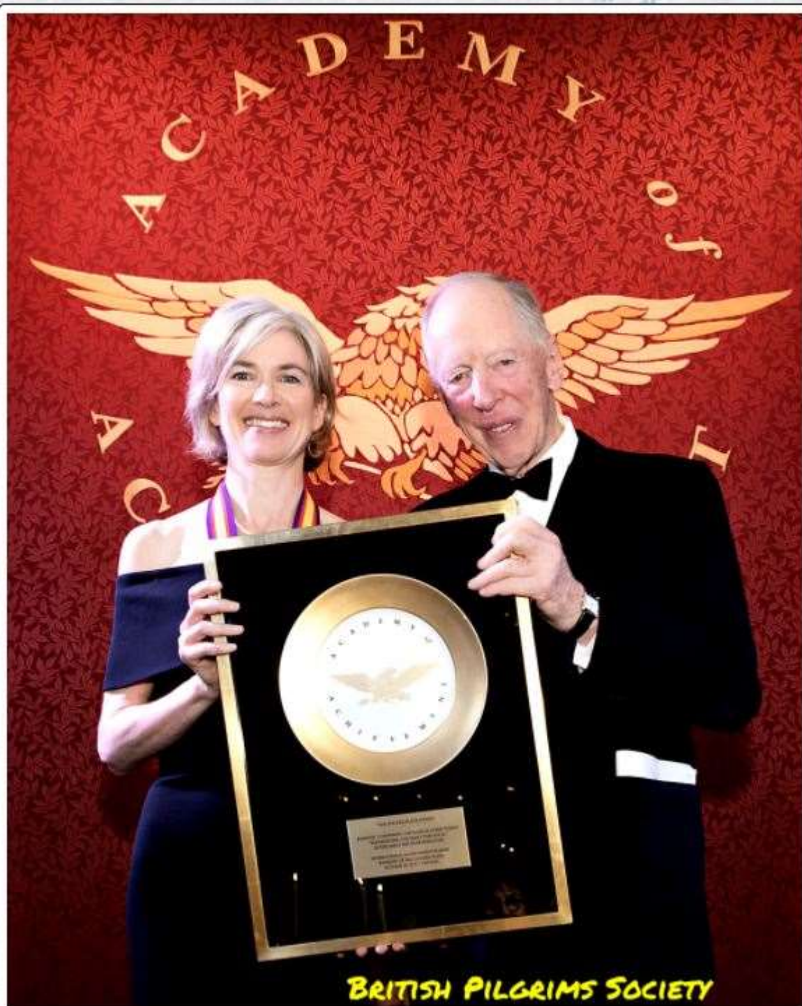
Awards Council member Lord Jacob Rothschild presents the Academy of Achievement's Golden Plate Award to Dr. Jennifer A. Doudna, co-developer of the CRISPR gene editing technology, in a ceremony at Claridge's in London.

the discovery of HIV1, Dr. Luc Montagnier confirmed the research of the team of Indian scientists. Covid-19 is not a virus, it is a “Bioweapon!”