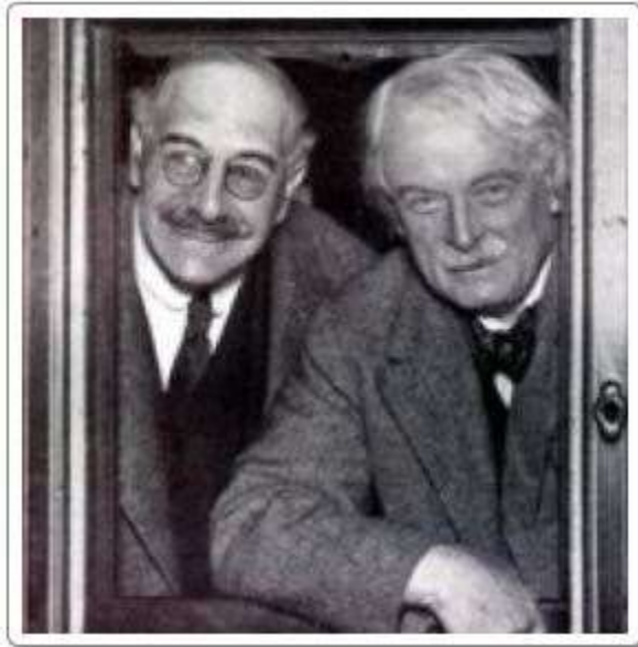
Fig. 4—L/R: Sir Alfred Mond, Zionist, president, Brunner Mond (later ICI, AstraZeneca); prime minister David Lloyd George, ca. 1914. Co-founders of the British Pilgrims Society and co-conveners of the First Imperial Press Conference, 1909 .

propaganda took flight along with the formation of MI6, MI5 and GC&CS now GCHQ. Mond was president of Brunner Mond chemicals, later Imperial Chemical Industries (ICI) and AstraZeneca. He also did substantial business in Israel.