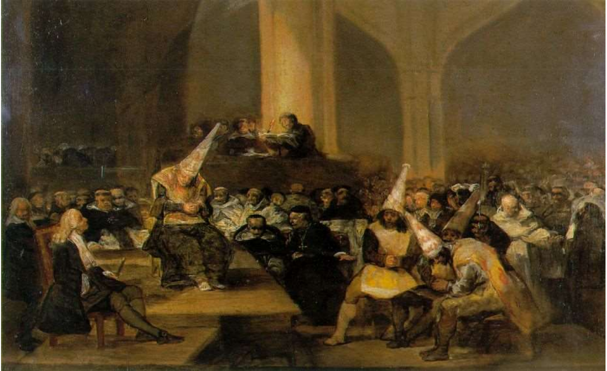
Francisco Goya: The Spanish Inquisition (1812-1819) Real Academia de Bellas Artes de San Fernando, Madrid