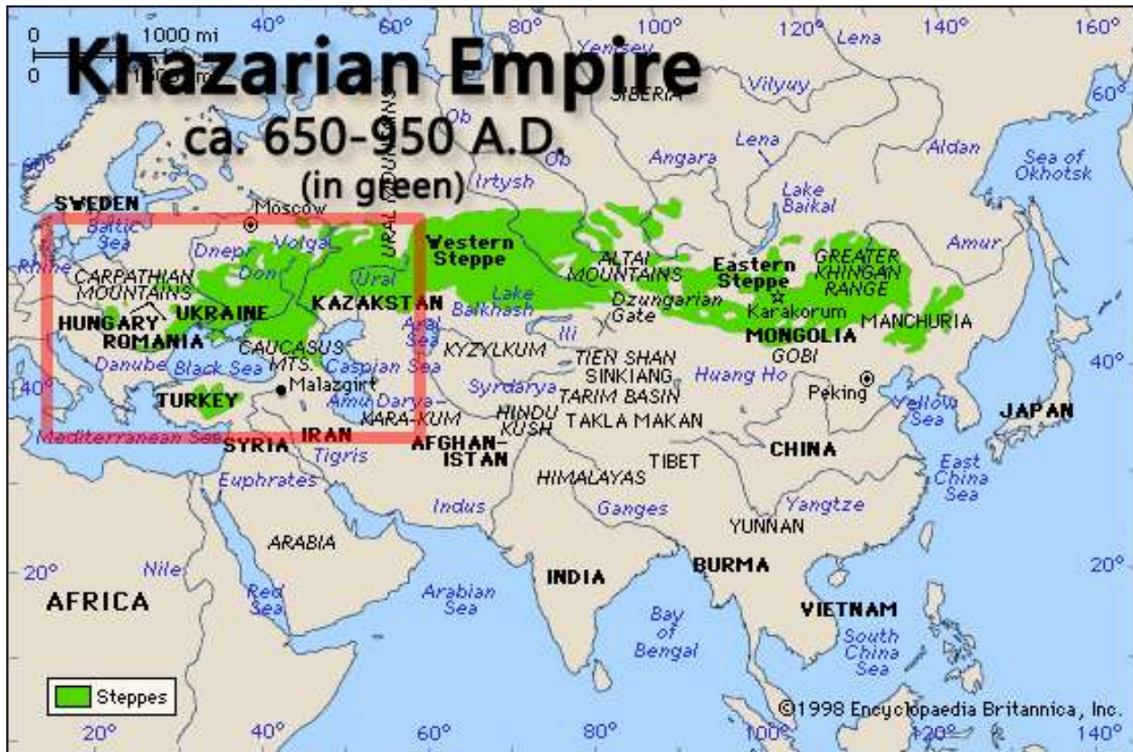
The Khazarian Empire, 650-950 A.D. The origins of Ashkenazi Jewry in Europe.

On Jun. 21, 2017, "Frontiers in Genetics" published "The Origins of Ashkenaz, Ashkenazic Jews, and Yiddish." They concluded that even the term "Ashkenaz" has its origins in four villages in Turkey. This area was the southernmost Eurasian steppe that comprised the Khazarian Empire.