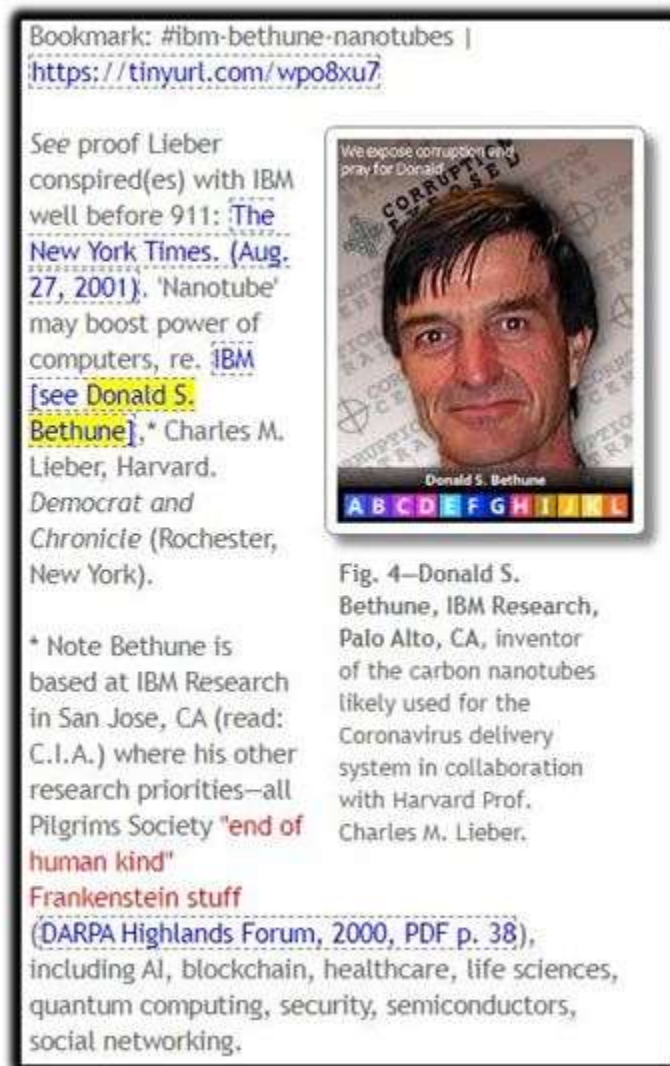
Fig. 4—Donald S. Bethune, IBM Research, Palo Alto, CA, inventor of the carbon nanotubes likely used for the Coronavirus delivery system in collaboration with Harvard Prof. Charles M. Lieber.

https://americans4innovation.blogspot.com/2020/03/weaponized-coronavirus-is-anglo.html#ibm-bethune-nanotubes https://tinyurl.com/wpo8xu7