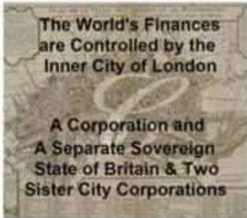
INNER CITY OF LONDON CONTROLS MONEY