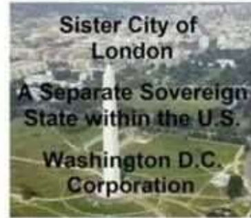
WASHINGTON D.C. CONTROLS MILITARY