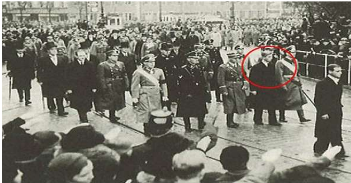
Phillip at his Sisters funeral - Note the Nazi salutes

Queen Elizabeth’s husband, HRM Prince Phillip was a Nazi during the 1930s. The photo below and on page 18 shows him at his sister’s funeral.