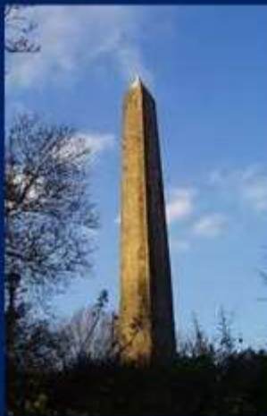
The City, London