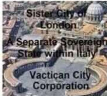
VATICAN CITY CONTROLS RELIGION