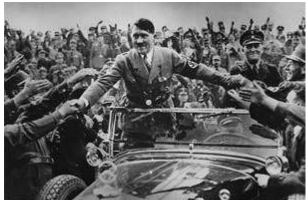
Hitler, laughing all the way to the BIS, was proclaimed Führer on January 30, 1933.

You can always follow the money trail to the scene of the crime. Nothing in this world happens without money, and war is the most expensive business of all. When you see the Red Cross flag always think "Knights Templar."