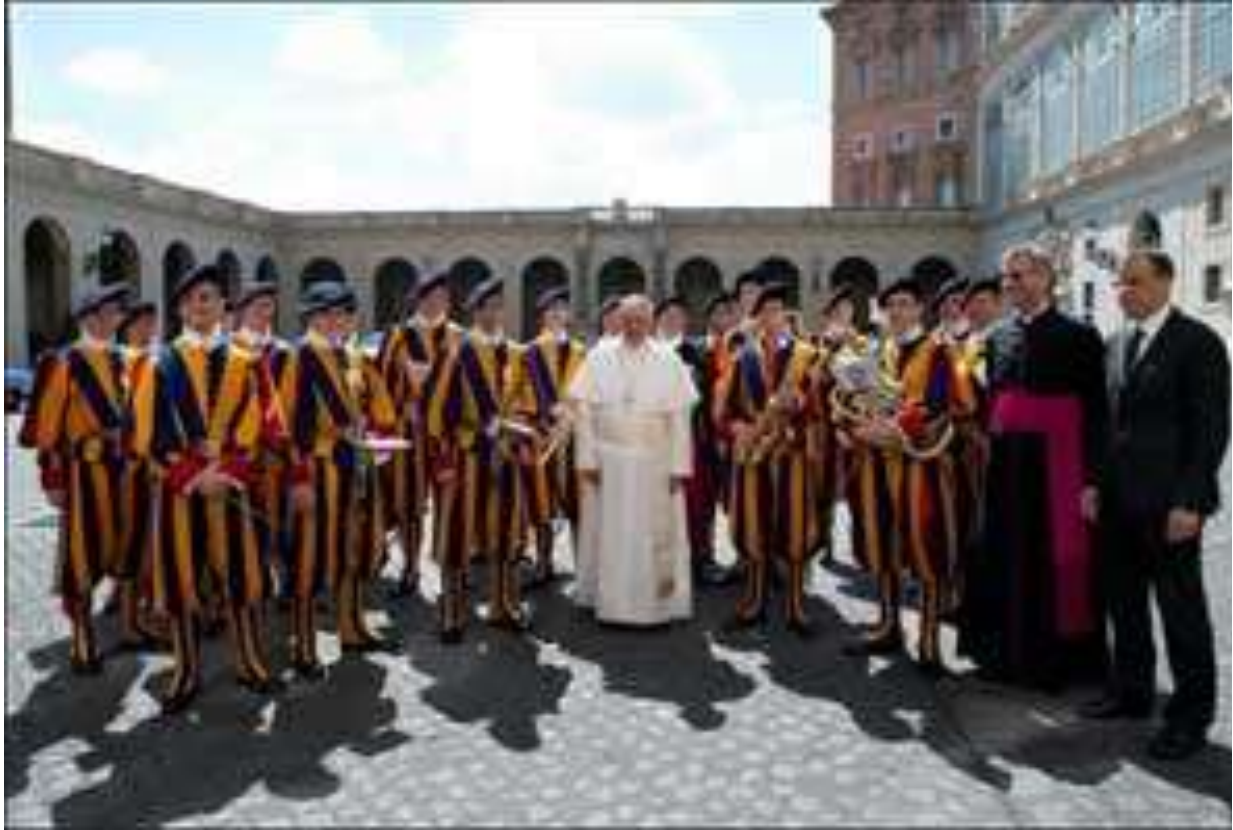
Pope Francis surrounded by the Swiss Guard.

The Swiss Guard, like their Knights Templar ancestors, are very proficient in the use of all kinds of weapons. John Paul II was the only Pope to die as the result of gunshot wounds. Not one Swiss Guard is a food or drink taster. Poison in the communion cup of Borgia or the host has been the preferred methods of getting rid of recalcitrant Popes.