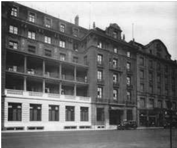
The innocuous looking HQ of the BIS in Basel, Switzerland, until 1977.