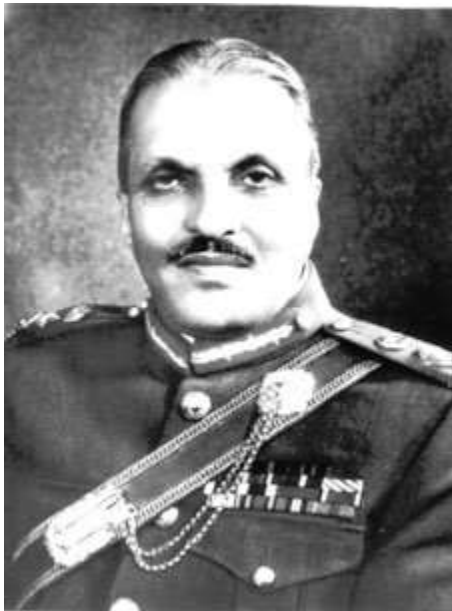
General Muhammad Zia-ul-Haq

On August 17, 1988, the President of Pakistan General Muhammad Zia-ul-Haq died during a suspicious airplane crash. It's rumored the Club of Rome was ordered by the Committee of 300 to eliminate ul-Haq.