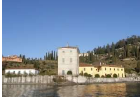
Rockefeller's private estate in Bellagio