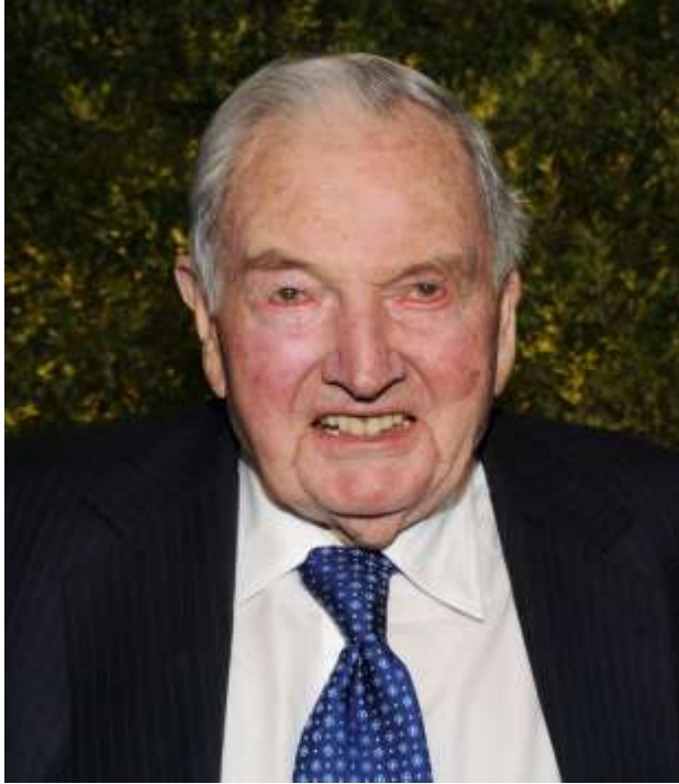
Elite 'humanitarian' David Rockefeller.