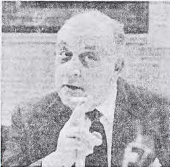
Left: Lord Rothschild—gathering together a wide range of biotechnology investments

In the year ending May 31, the fund received 82 investment proposals, of which 37 came from the U.S., compared with 16 from Britain, three from Israel and one apiece from Belgium, Canada, Finland,