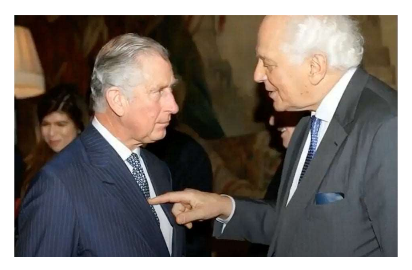
Above – Nathan Rothschild offering a word of advice to Prince Charles. "You are the Messiah and you better get around to asserting the role Lucifer created specifically for you. You only have seven years to show the world who you really are! Now get too it Prince!"