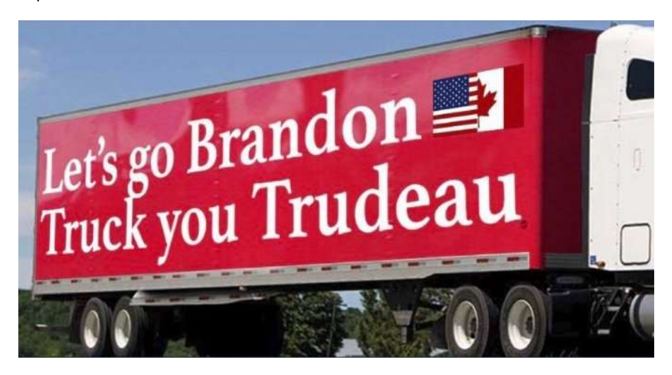
"One-Two Punch Strategy" Summarized in One Photo

As more and more Canadians wake up to the hard ugly fact that there's a stone-cold traitor living at 24 Sussex Drive, the more who are eagerly joining and/or supporting the unparalleled FREEDOM CONVOY 2022 movement.