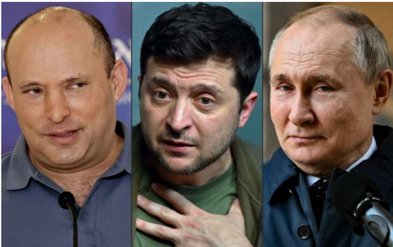
Prime Minister Naftali Bennett (L), Ukrainian President Volodymyr Zelensky (C), and Russian President Vladimir Putin.

Naftali Bennett didn't push Zelensky to 'surrender' to Putin, says top Ukraine adviser Mikhail Podolyak says Israel urged Moscow 'to assess events more adequately' amid reports premier suggested Ukrainian leader yield to significant concessions to end the Russian war. There is much that we do not know about this proposition supposedly suggested by Naftali Bennett that speaks of a double-cross between various groups orchestrating this war from those wanting to keep churning the historical and geopolitical regions of Eurasia. Keep this in mind as Putin has turned up the stakes in the Ukraine. In four decades of study of the larger protracted conflict, I believe Putin is about to get revenge by using his Ezekiel alliance as grounds for stealing and controlling the oil and gas energy fields of Israel known as the Leviathan oil field located off the Israeli coast.