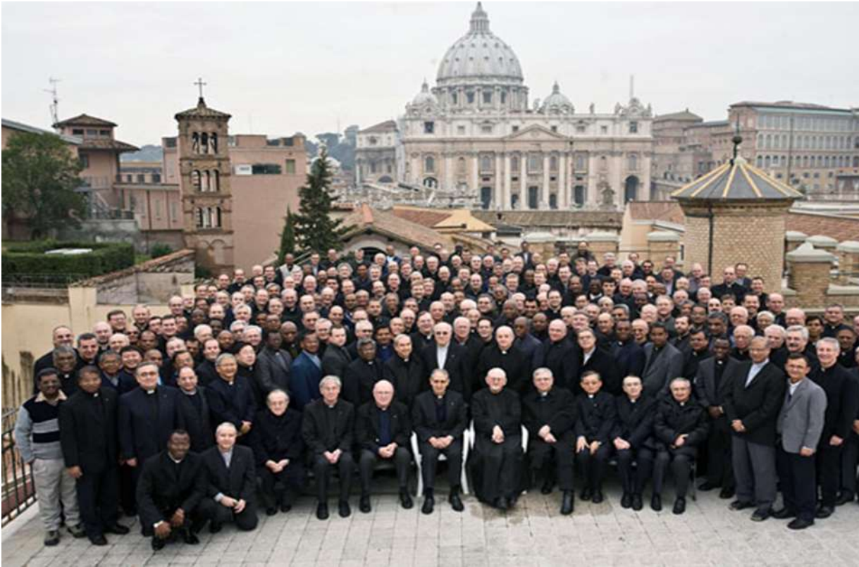
35th Jesuit general congregation at the Vatican in 2008

It is also important to note that the Jesuit-controlled Vatican is since 1929 being cast (and accepted) as a sovereign microstate called Vatican City, with its own: