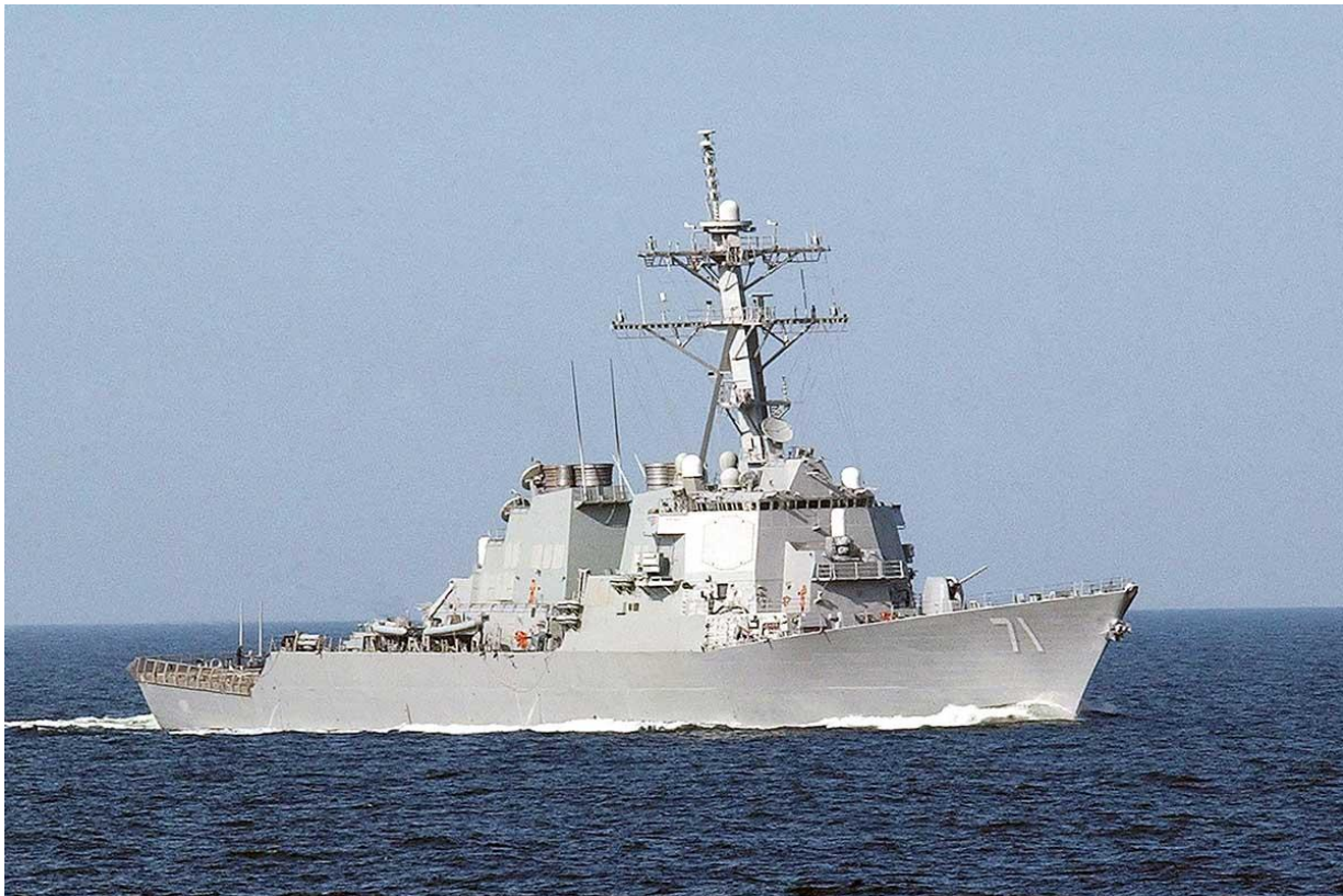
The US Navy Destroyer USS Ross has arrived on-station in the eastern Mediterranean Sea off the coast of Syria.

The TOW launcher is widely carried on various vehicles, and even helicopters. The launcher can be mounted on HMMWVs. It is employed as the main anti-tank weapon by M2 infantry fighting vehicle and M3 Bradley cavalry fighting vehicle. Also there are dedicated anti-tank missile carriers, based on the Stryker (M1134) and LAV-25 (LAV-AT). The M1134 is used by the US Army, while the LAV-AT is used by the US Marine Corps. Also there is an obsolete M901 anti-tank missile carrier, based on the M113 armored personnel carrier chassis that is still in used by some countries.