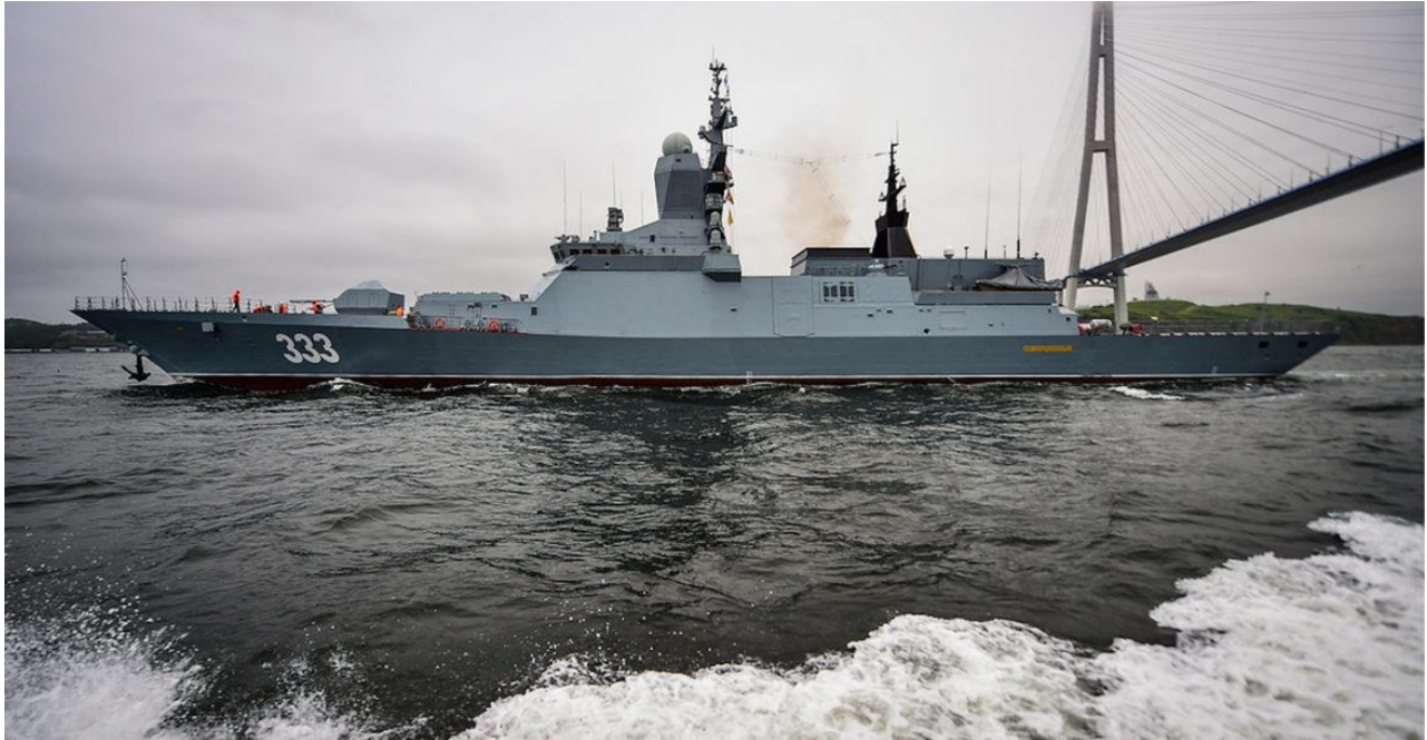
The Sovershenny corvette heading to the main base of the Russian Pacific Fleet, in the Zolotoy Rog [Golden Horn] Bay.

Russian naval vessels armed with Kalibr cruise missiles will patrol off the coast of Syria, where Moscow is supporting President Bashar al-Assad's regime, in order to ward off terrorist threats, President Vladimir Putin said.