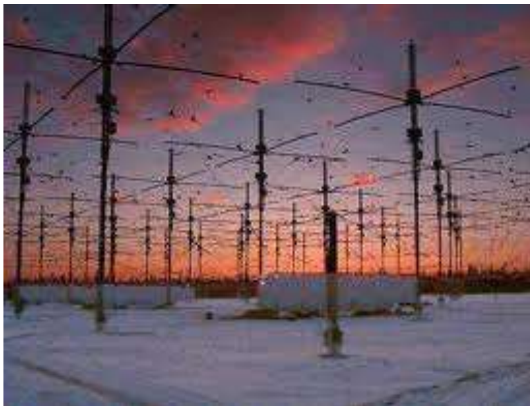
HAARP array: Gakona, Alaska

HAARP (High Frequency Active Auroral Research Program) was a little-known, yet critically important U.S. military defense project which generated quite a bit of controversy over its alleged weather control capabilities and much more.