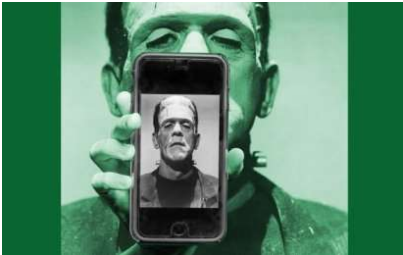
Behold: The Frankenstein of our Day