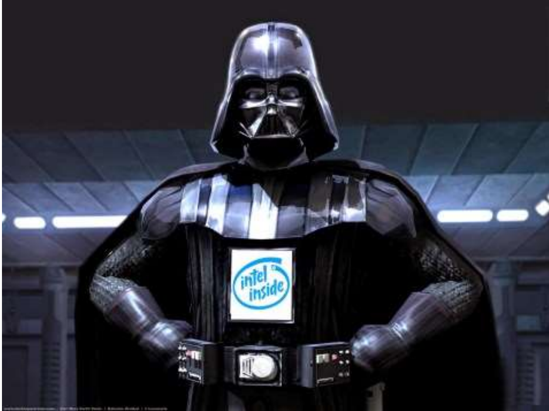
DARPA Vader and the Evil Intel Empire Inside Uncovering the DoD Sith Lords that Control Your Laptop