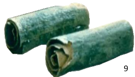
9 Copper Scroll

One of the most fascinating of the finds was a copper scroll which had to be cut in strips to be opened and which contained a list of 60 treasures located in various parts of Judea, none of which have been found! Another