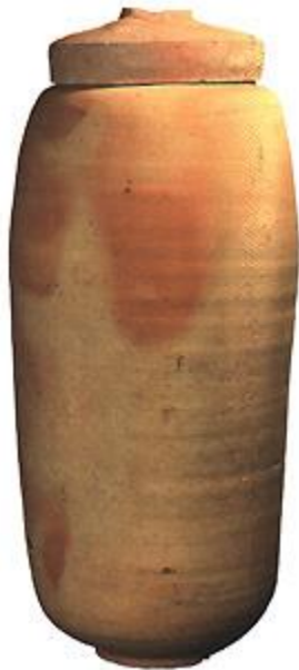
Clay jar of the type the Dead Sea Scrolls were found in. From Qumran, now in the Citadel Museum, Jordan.