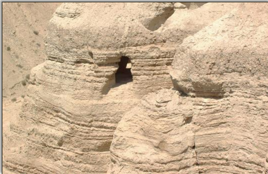
Cave 4 at Qumran where approximately 15,000 fragments from some 574 manuscripts were found