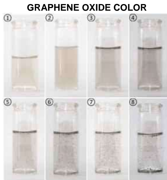
Graphene Oxide (GO) and Reduced Graphene Oxide (RGO)

Here's a second peer reviewed study confirming that Graphene Oxide toxicity transmission from the vaxxed to the unvaxxed is airborne . This means GRAPHENE OXIDE is received from the vaxxed to the unvaxxed by inhalation .