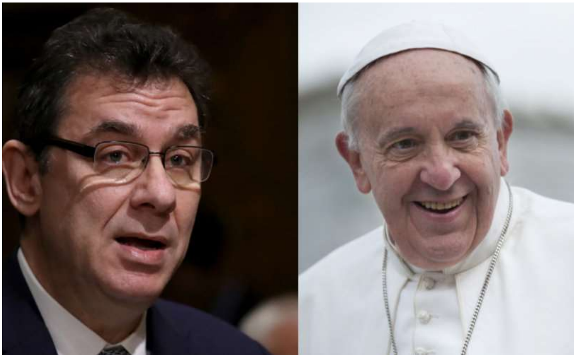
Pfizer CEO Albert Bourla and Pope Francis Bourla