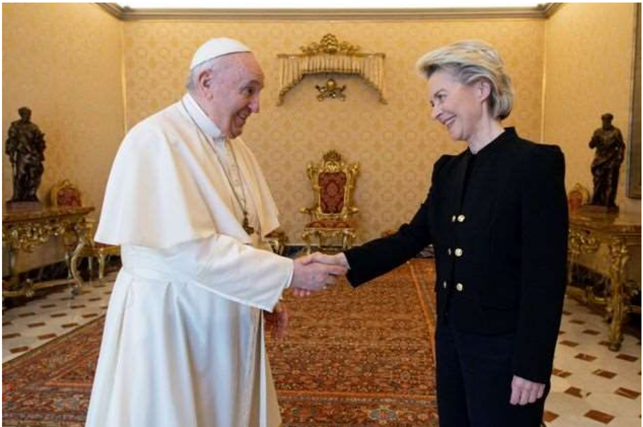
Francis welcomes E.U. President Ursula van der Leyen to the Vatican

All Vatican employees are currently forced to get vaccinated or show proof of recovery from COVID-19. Failure to do so will be considered "unjustified absence with the consequent suspension of pay for the duration of the absence."