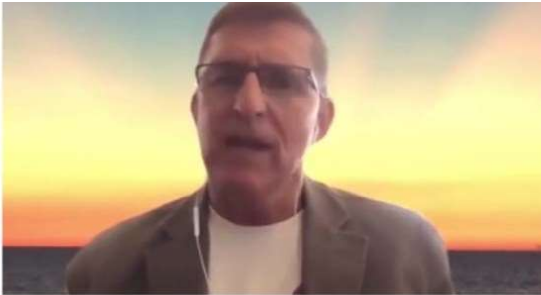
Respected US Army General Michael Flynn (retired)