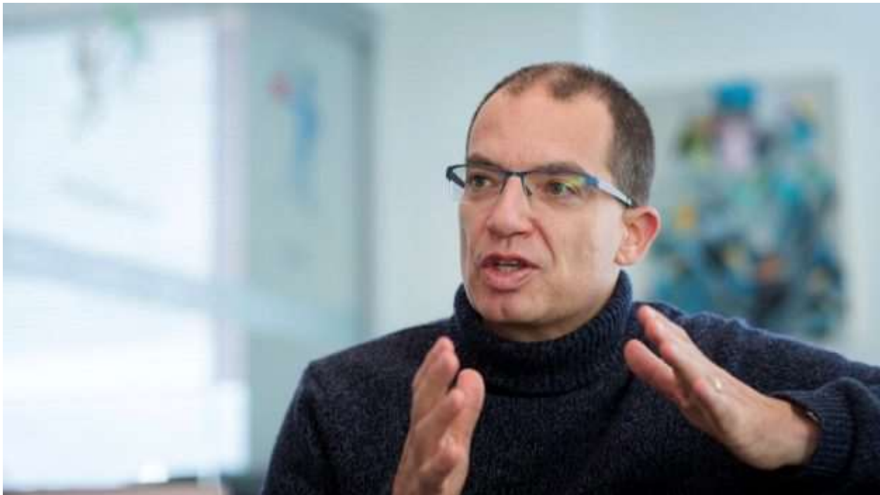
Moderna CEO Stéphane Bancel

Described by UK officials as a " sharpened tool " in the nation's continued vaccination campaign, the reformulated vaccine combines the previously approved COVID-19 vaccine with a " vaccine candidate " targeting the Omicron variant BA.1. That vaccine candidate has never been previously approved and has not been the subject of independent study. The MHRA approved the vaccine based on a single, incomplete human trial currently being conducted by Moderna. The company promoted incomplete data from that trial in company press releases in June and July . The study has yet to be published in a medical journal or peer reviewed. No concerns have been raised by any regulatory agency, including the MHRA, regarding Moderna's past history of engaging in suspect and likely illegal activity in past product trials, including for its original COVID-19 vaccine.