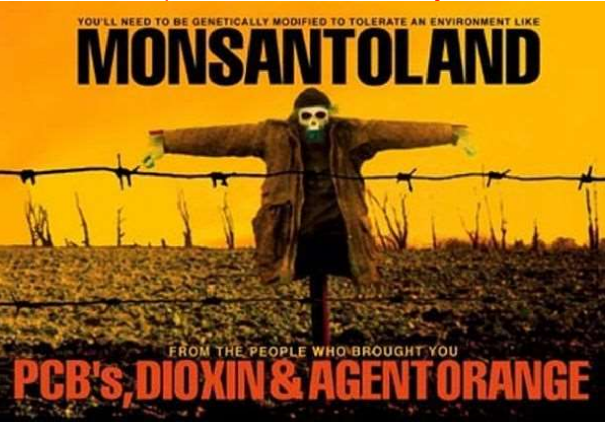
Top 10 Poisons that are Monsanto Legacies

settled more than 500 cases for $21 million in 2014 and an additional 3,000 cases for about $200 million in 2015.