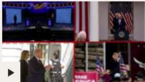
Trump's seven days before his Covid-positive test