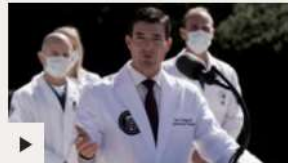
President's doctor 'extremely happy' with progress