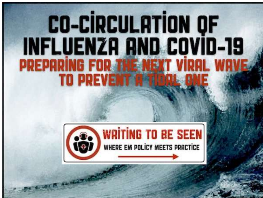
October Surprise 2020

Of course, imposing an Orwellian set of controls and restrictions in the name of combatting a 'deadly pandemic' will be quite an easy task since all they will have to do is piggyback the regular flu season with the coronavirus and call every case of influenza COVID-19, even though they aren't. See how the crafty messaging has already begun in the following fear mongering visual.