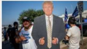
In Pictures: Trump supporters hold rallies