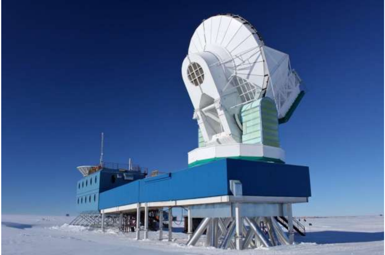
Above: Picture of the South Pole Telescope.

Then there is the binary-lens telescope atop Mount Graham, Arizona, interestingly run by the Jesuits and called “Lucifer”. Various articles suggest that the Mount Graham site is perfect to study the sky in the southern hemisphere in the direction of the South Pole in Antarctica.