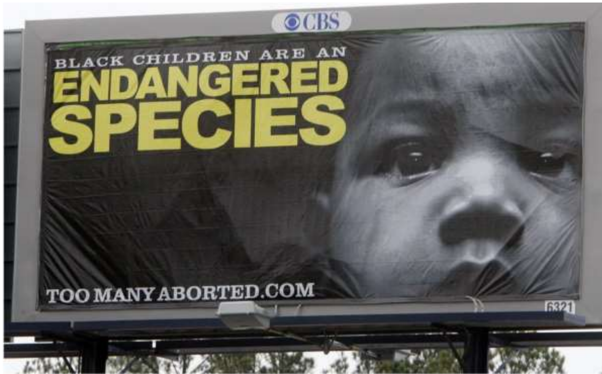
An anti-abortion billboard in Atlanta in 2010.

Anti-abortion groups hired black activists and highlighted uglier aspects of the history of reproductive health care — in particular, the courting of the eugenics movement by Planned Parenthood founder Margaret Sanger in the early part of the 20th century. A right-wing documentary, Maafa 21: Black Genocide in 21st Century America , used a Swahili word that refers to the holocaust of African enslavement to denounce Planned Parenthood as racist. Billboards in Atlanta and Manhattan carried messages like, “The most dangerous place for an African American is in the womb.” And federal and state legislators proposed a series of bills banning race- and sex-selective abortions in order to insinuate that abortion providers deliberately target communities of color.