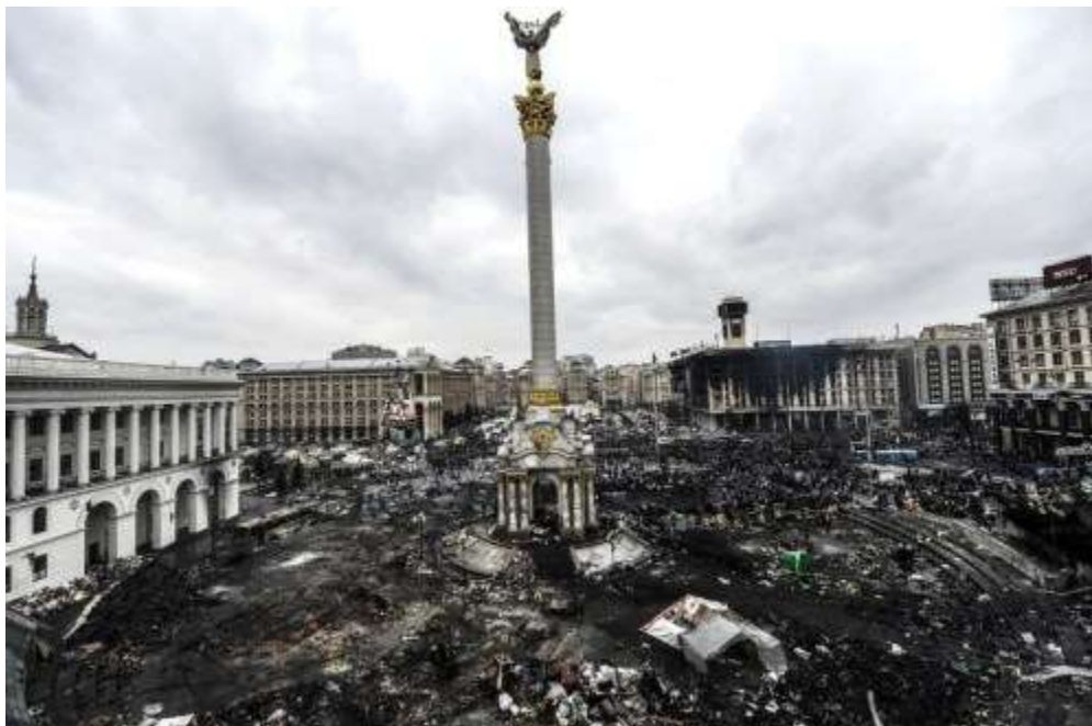
The Maidan or central square in Kiev, Ukraine after the disastrous coup d'état that was directed and financed by the U.S. The Ukraine: Another CIA-Coordinated Coup d'état ... For The USA And Israel

It seems that neither of these Western dupes understands that this is not 1917. And that Vladimir Putin is not Czar Nicholas of Romanov fame. They also fail to realize that many of their fellow oligarchs abroad, as well as political pawns at home, have met with disastrous fates; such are the forces from on high which have aligned with Putin's master plan for a strong and sovereign Russia. Each one of the many oligarchs, acting out of extreme self-interest as they have, cannot even hope to touch Putin now that state power has been irreversibly consolidated to administer the Kremlin's will.