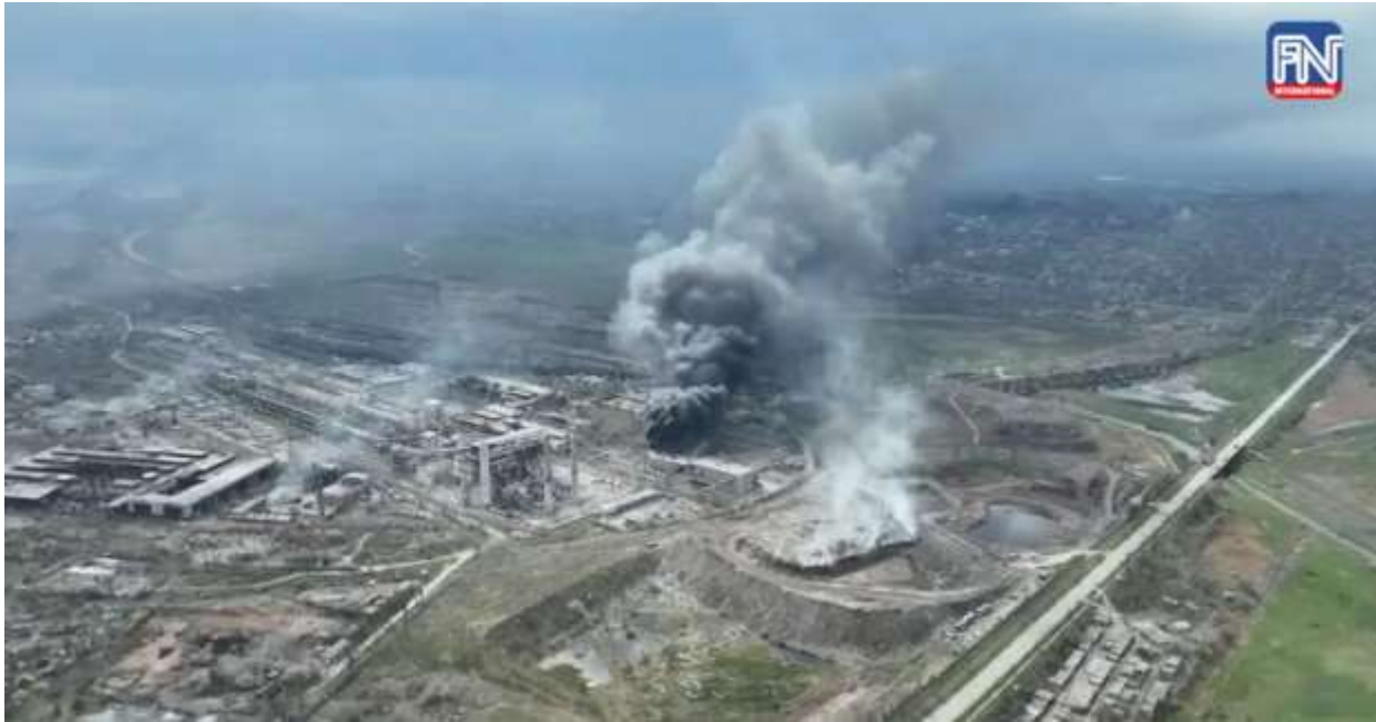
Azovstal Iron and Steel Works in Mariupol, Ukraine under attack by the Russian military

Here's the main reason why Russia has to completely neutralize Ukraine! Posted on April 27, 2022 by State of the Nation