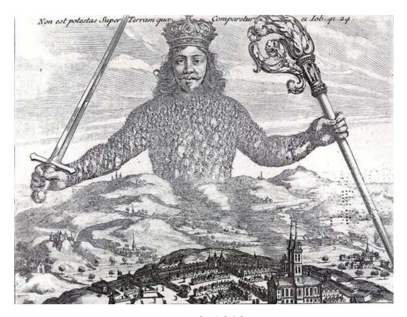
By Douglas Gabriel

The British Empire's unquenchable imperialistic, hegemonic desires and lust for world dominance bred the fascism of Germany, Italy, Russian, Spain and many other countries. By controlling the imaginary goal of world peace, which is the lie of the United Nations, Britain has been able to implant their version of the Venetian banking model into world politics using sophisticated propaganda to cover their depopulation schemes of war, death, and the end of national sovereignty. Through wars of bullets, bombs, newspapers, radio, television, vaccines, bioweapons, and nation-fleecing, the monarchy of Britain has ruthlessly manipulated trade, empire building, politics, international relations, diseases, resource theft, underhanded corporate deals, and the drive towards a one world government, which will be controlled by them.