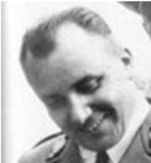
Skorzeny's photos below: As a boy, perhaps 10 or 11 years old With German Navy seaman's uniform) 1930's Christmas party (with other top Nazis)