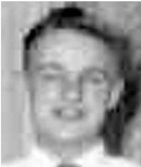
Date unknown (likely 1950s) Wedding day (late 1950s?)