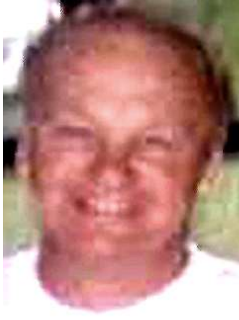
September 30, 2000