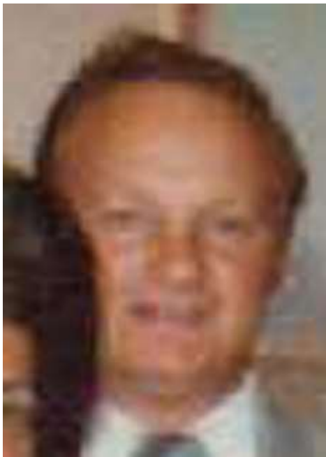
April 3, 1983 (Easter) 1986 Boynton Beach, Florida October 23, 1989 (Boynton Beach Inlet, Florida)