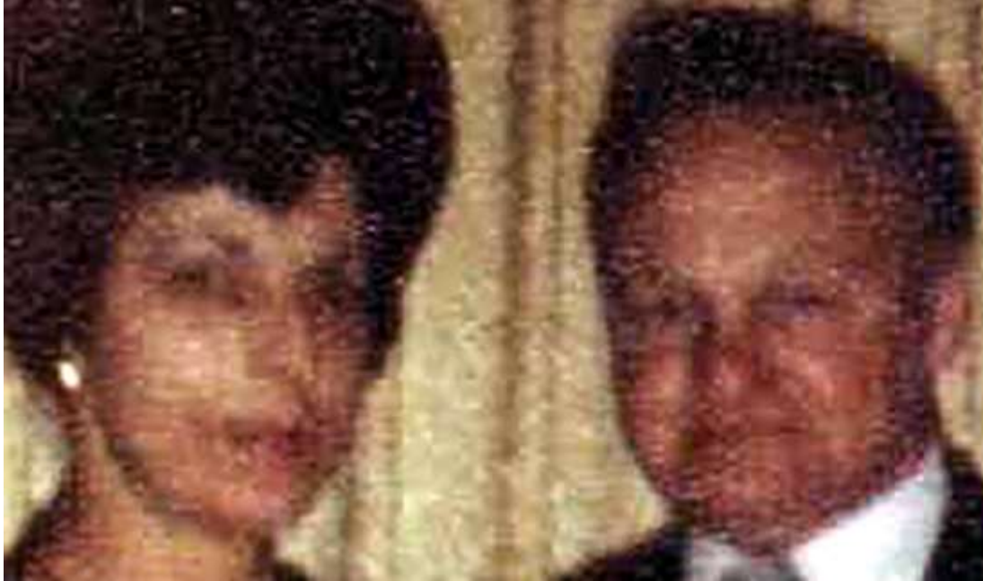
1974 (standing next to his wife) 1979 (wedding reception August 11, 1979