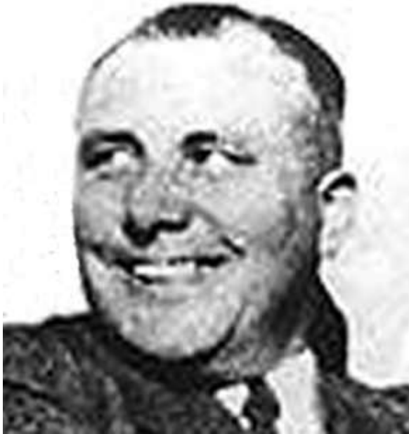
from 1939 Nazi Calendar Hitler at Berchtesgarden