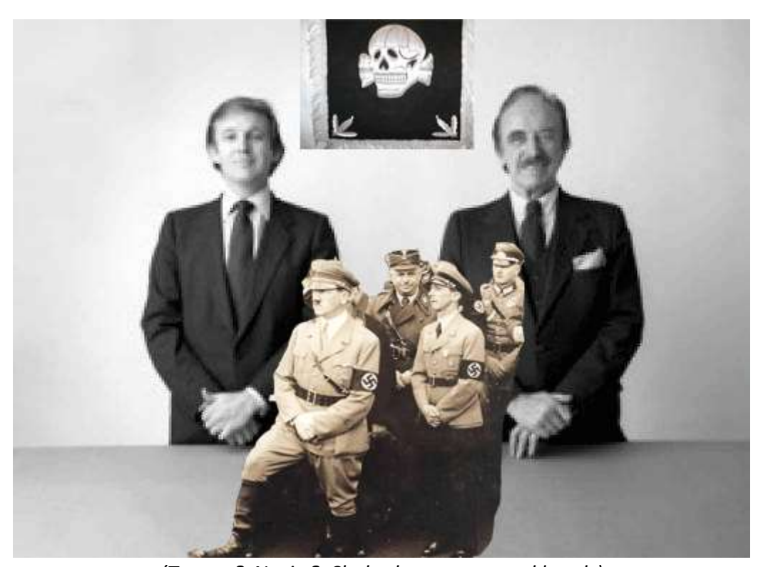
(Trump & Nazis & Chabad -same crossed hands)

Its central commandment is fulfilling the commandment "Breaking Through", I.e., making the world safe for Zionist world domination.