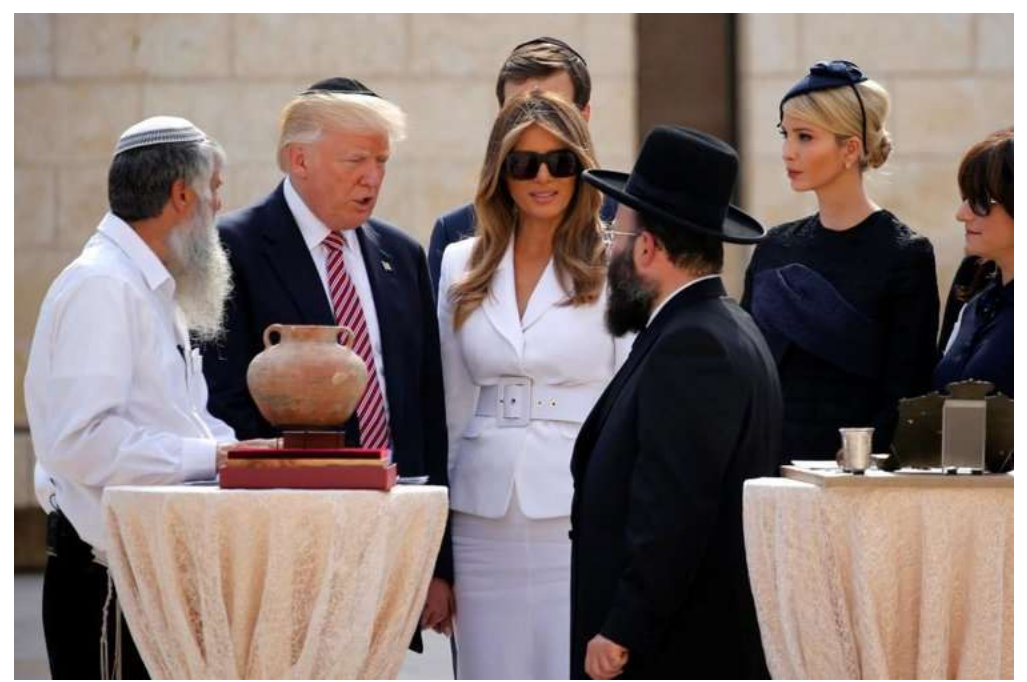
(Chabad members, Kushner's have Trump's ear.)

Under their leader Rabbi Menachem Mendel Schneerson, (1902-1994) above, the movement established a network of nearly 4,000 institutions that provide religious, social and ideological support to Jews in over 1,000 cities, spanning 100 countries including all US states.