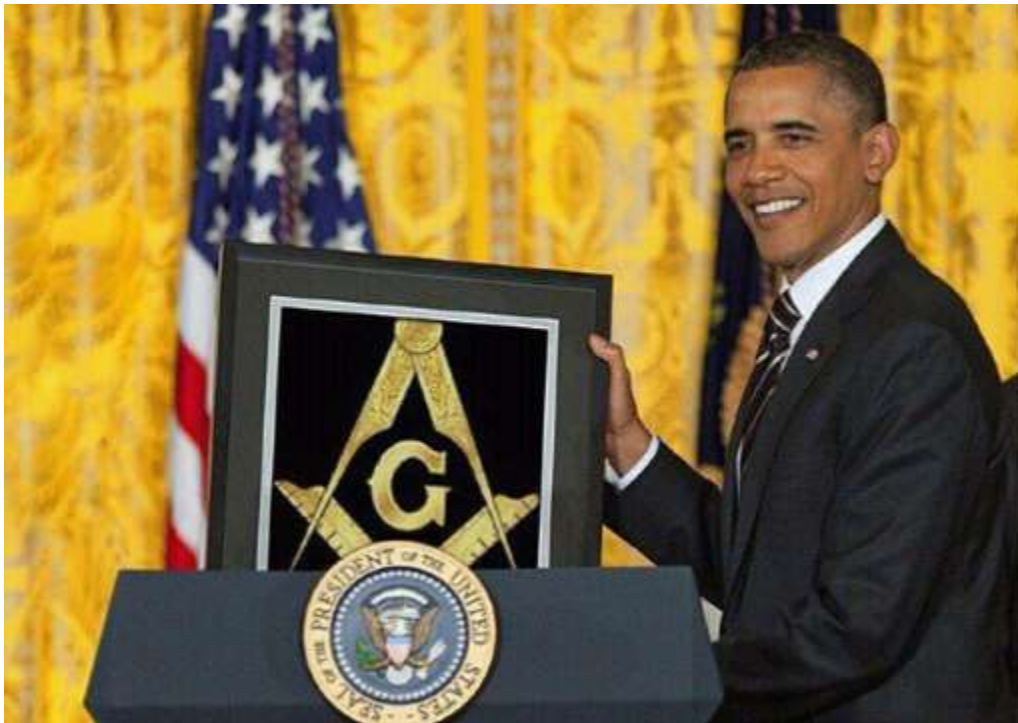
Above: Barack Hussein Obama accepting a Masonic square and compass plaque.