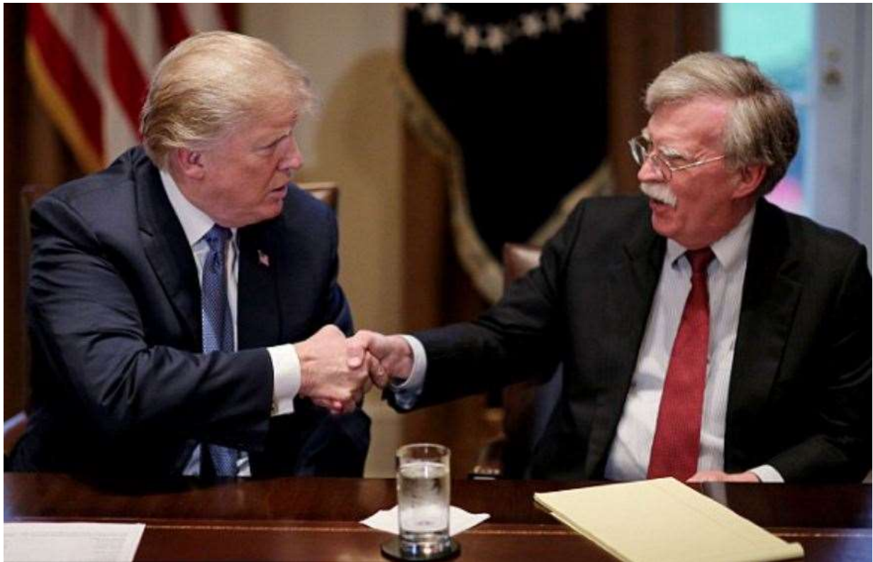
Above: Note the Masonic handshake (thumb over the knuckles) A clear handshake between two Lodge brothers. This is a perfect picture of two Cabalists sealing a deal Masonic style.

However, compelling evidence suggests Trump is nothing more than a Trojan horse Crown Agent, loyal to the City of London banker's, i.e., the House of Rothschild. In attempting to figure out the enigma of President Trump, knowing that Trump is a Freemason goes a long way in explaining many questions and issues.