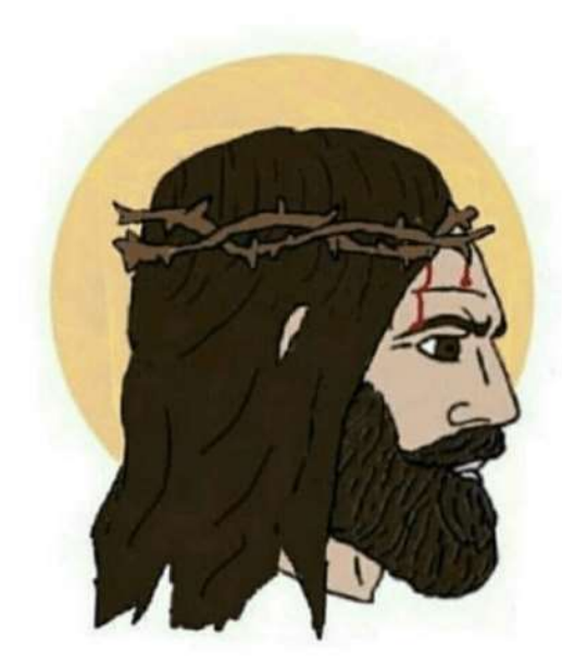
I will touch this leper

Pray for those considering taking a similar option that they would consider the fact that they were made in the "Imago Dei", the image of God, with value and purpose. That they would embrace the challenges, struggles and illnesses we face with an attitude of joy and perseverance, as we are commanded to do in Scripture.