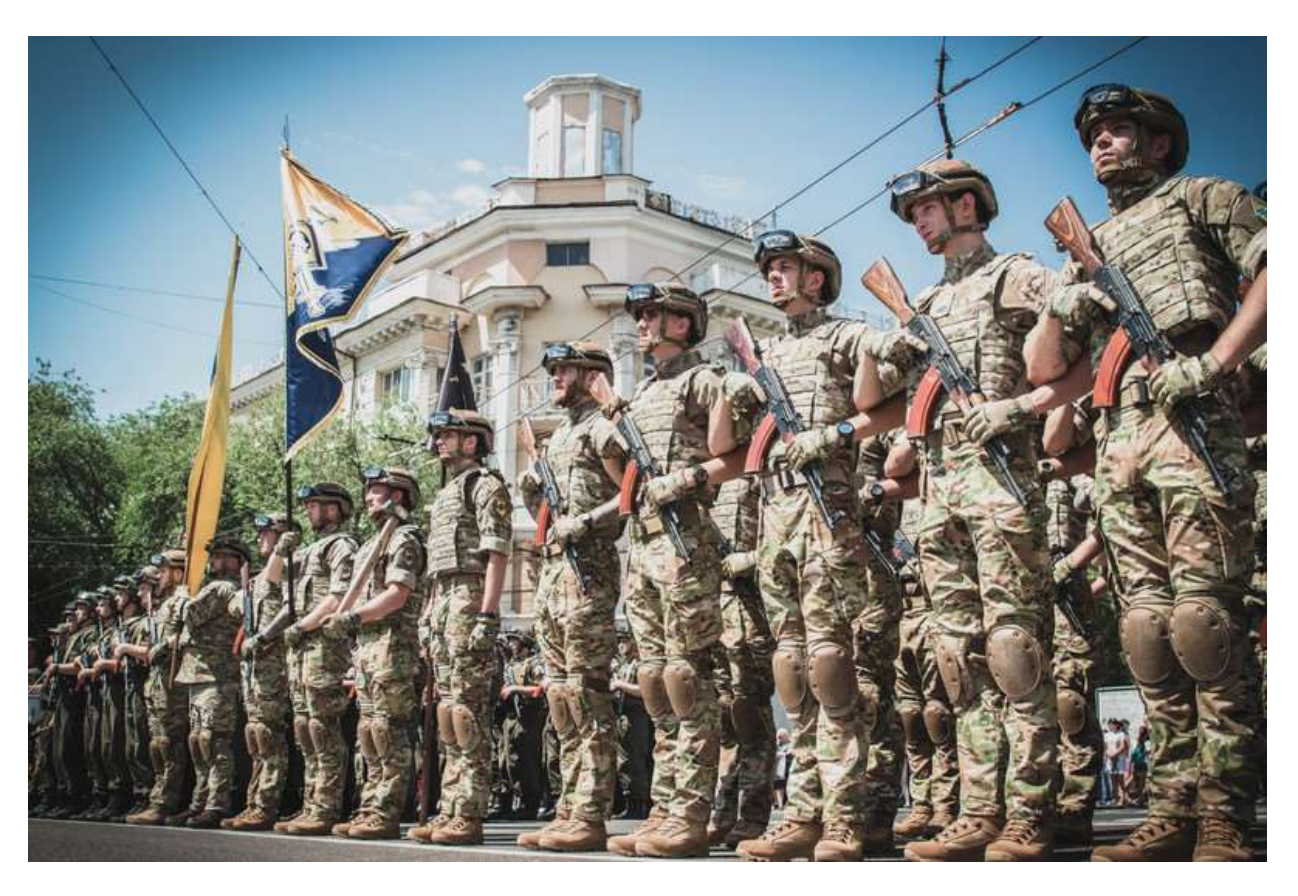
Ukraine's Nazi Azov Battalion on parade in 2017.

But a letter from the Israeli defense ministry's arms exports agency, as well as photos and videos from Azov's own online presence proved otherwise.