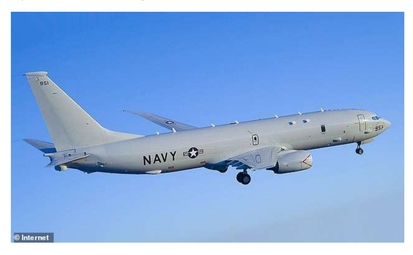
The U.S. Navy deployed one of its Boeing Poseidon P-8 maritime surveillance aircraft on the Black Sea coast over Romania in the hours before the Ukrainian attack on the Moskva.

Later, the Kremlin was forced to admit the vessel - named in honor of the Russian capital - had been taken out by hostile action.