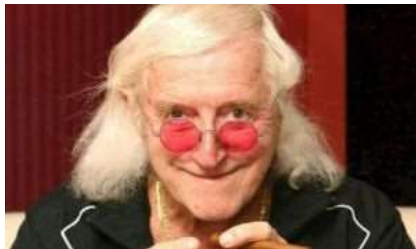
Jimmy Savile – the pedophile friend of Prince Charles.

The Coronation Emblem above was released by Buckingham Palace recently.