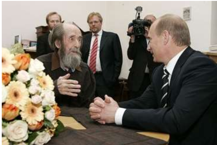
Solzhenitsyn with Putin

Biding their time, they nurtured their hatred and plotted their revenge along with a new reinvention. They became the power behind the heinous Bolsheviks who took over the Russian government in the 1910s, killed 66 million Christians, including 200,000 members of the Christian clergy, and destroyed 40,000 churches.