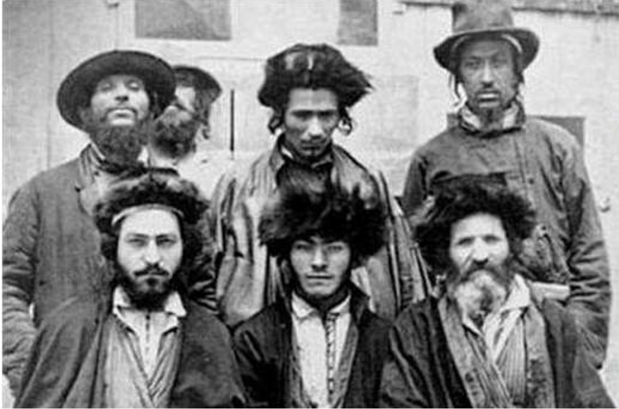
Khazar Ashkenazi Jews 1878

Biding their time, they nurtured their hatred and plotted their revenge along with a new reinvention. They became the power behind the heinous Bolsheviks who took over the Russian government in the 1910s, killed 66 million Christians, including 200,000 members of the Christian clergy, and destroyed 40,000 churches.