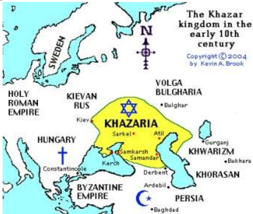
Khazaria overlapped Ukraine & Crimea

Today, Russia is under fire for the conflict in Ukraine. A conflict that was started by the neocon Ashkenazi Victoria Nuland in the U.S. State Department, with her neocon Ashkenazi husband Robert Kagan working in the background via powerful organizations such as Project for a New American Century, the Brookings Institution, and Council on