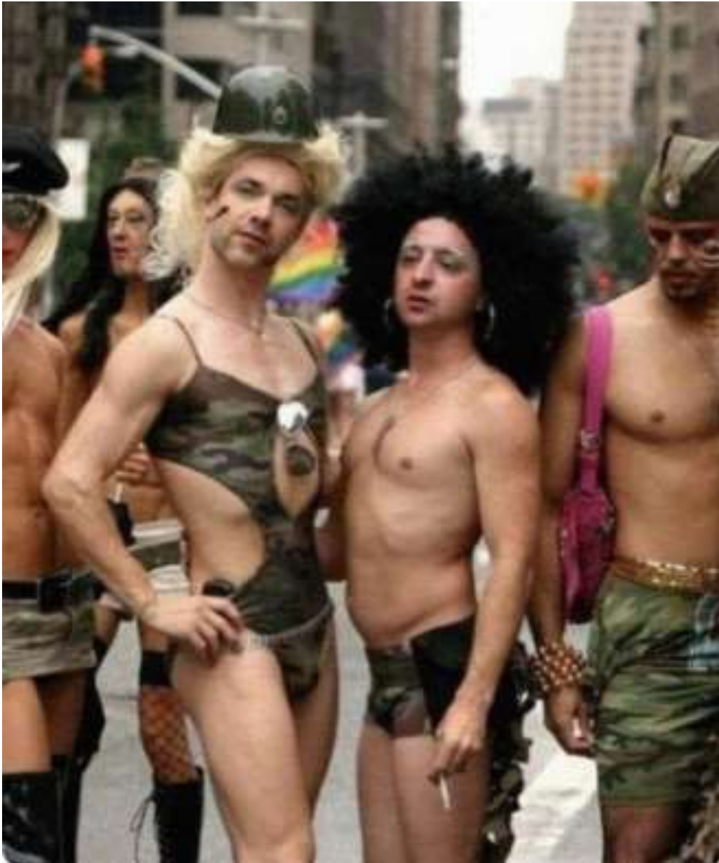
The immoral Zio-Nazi Jew: Ukrainian President Zelensky, center right, in gay pride parade

Now Russia has acted, and after a long hibernation the Bear has awoken with fury. Putin has ordered his army to liberate the Donbass region from the Ukro-Nazis and demilitarize and de-Nazify Ukraine entirely (i.e., the Donbass region will be cut off from Ukraine and become independent while Ukraine is to be reverted back into Russia's orbit and away from Jewish control).