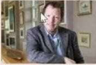
152 KB JPG

>Heir to the Rothschild family, Nathaniel Rothschild , today wrote to members of the British government, giving his view that Vladimir Putin is "the most dangerous man since the defeat of Hitler, with Xi Jinping a close second," and explained that,