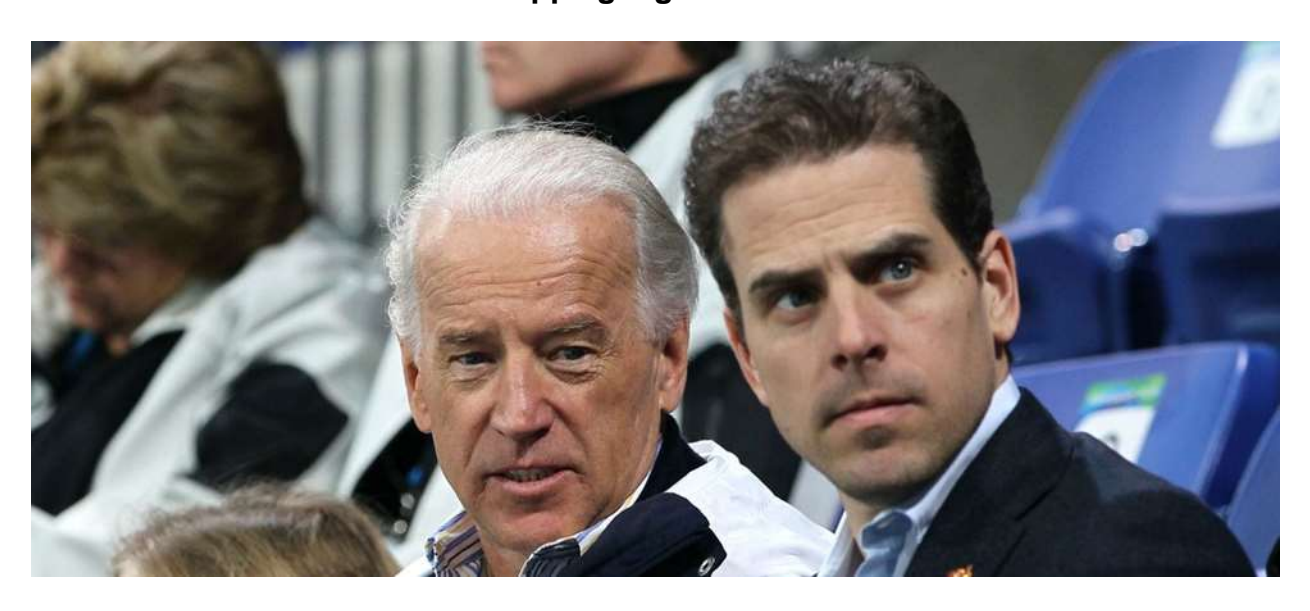
This was the real Joe Biden ^^^^ with son Hunter The Ear Lobes Don't Lie

He referenced specifically the new energy corridor the U.S. announced that the U.S. would link Europe to India through the Middle East, touching Israel, Jordan, Saudi Arabia, and the United Arab Emirates.