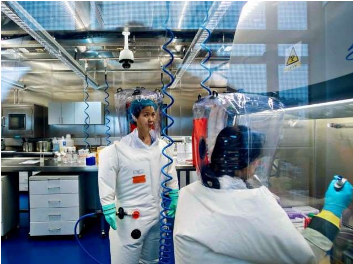
Chinese virologist Shi Zhengli is seen inside the P4 laboratory in Wuhan, capital of China’s Hubei province on February 23, 2017.

many as 20 species of coronavirus are “highly likely” to cause an outbreak among humans.