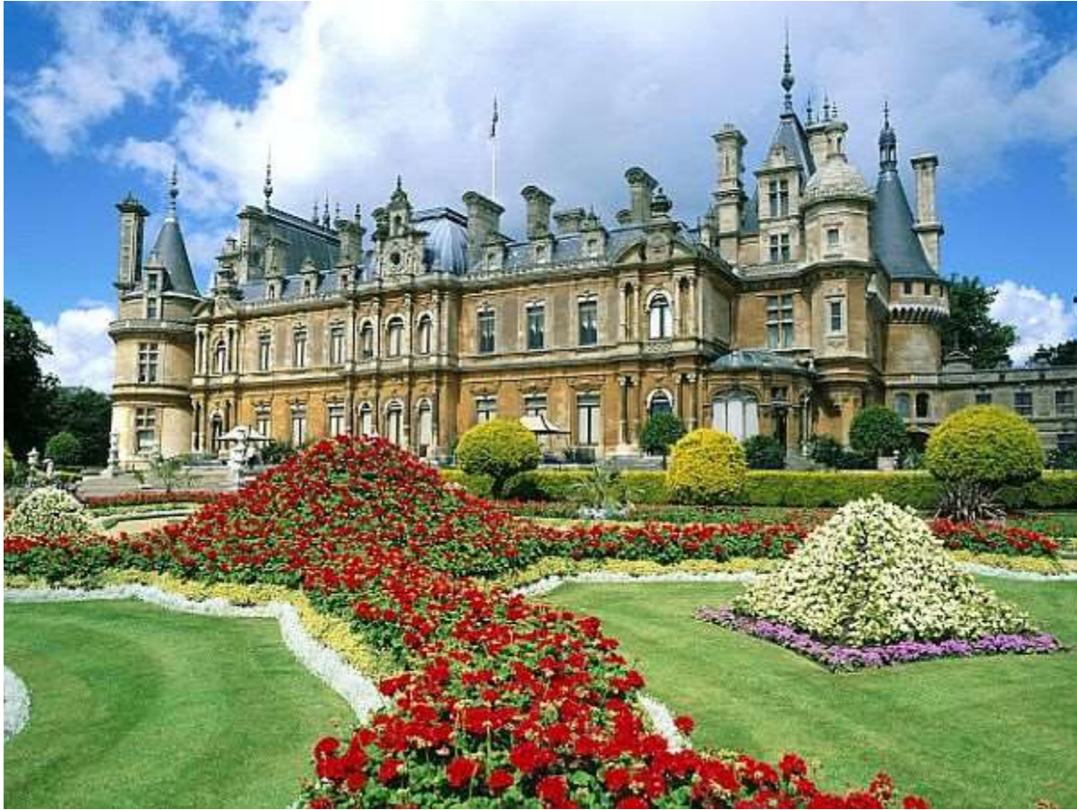
Rothschild Mansion Just one of a multitude of Rothschild Palaces

The Rothschild's "claim" that they are Jewish, when in fact they are Khazars. They are from a country called Khazaria, which occupied the land locked between the Black Sea and the Caspian Sea which is now predominantly occupied by Georgia.