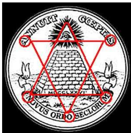
The Red Hexagram