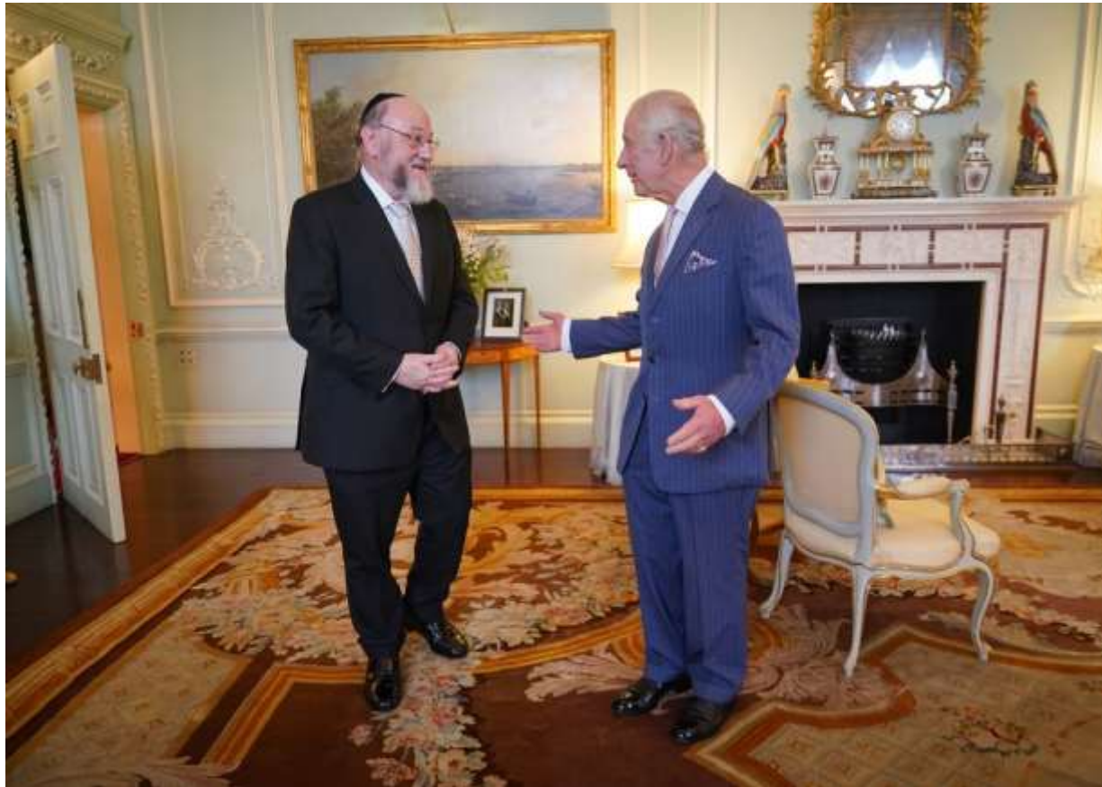
King Charles III receives Chief Rabbi Sir Ephraim Mirvis.

out of respect for the Chief Rabbi and Shabbat is quite a gesture." This year, King Charles knighted Rabbi Mirvis in his first honors list.