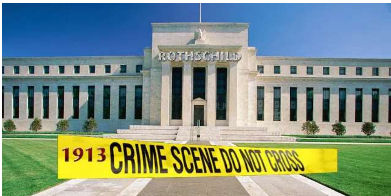
The Fed and the IRS