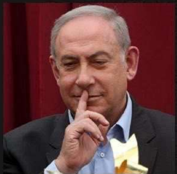
Benjamin Netanyahu, 1990

"America is a golden calf and we will suck it dry, chop it up, and sell it off piece by piece until there is nothing left but the world's biggest welfare state that we will create and control... This is what we do to countries that we hate. We destroy them very slowly."