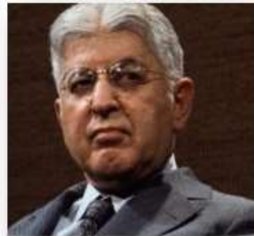
Arthur Burns (1904-1987) Federal Reserve Chairman (1970 to 1978)