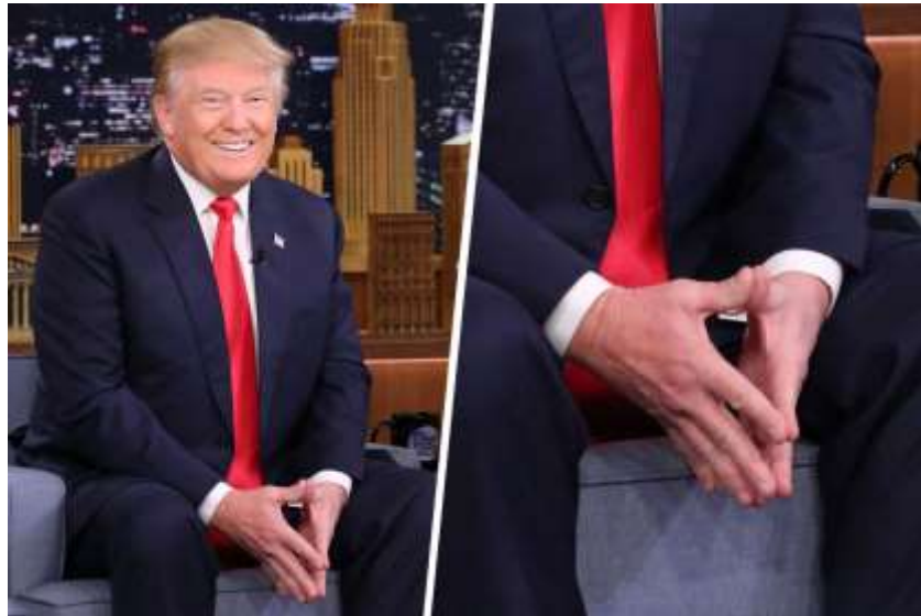
(Blackmailed, or following Masonic diktat?)

Patrick Byrne's story is absolutely incredible and has been largely ignored by the mainstream media since it turns out to be an amazing exposure of the Deep State shadow government, consisting of DemoRats and RINO's or Republican in Name Only. The halls of Congress and the Senate are filled with Masonic politicians, lawyers, judges, and law enforcement types.