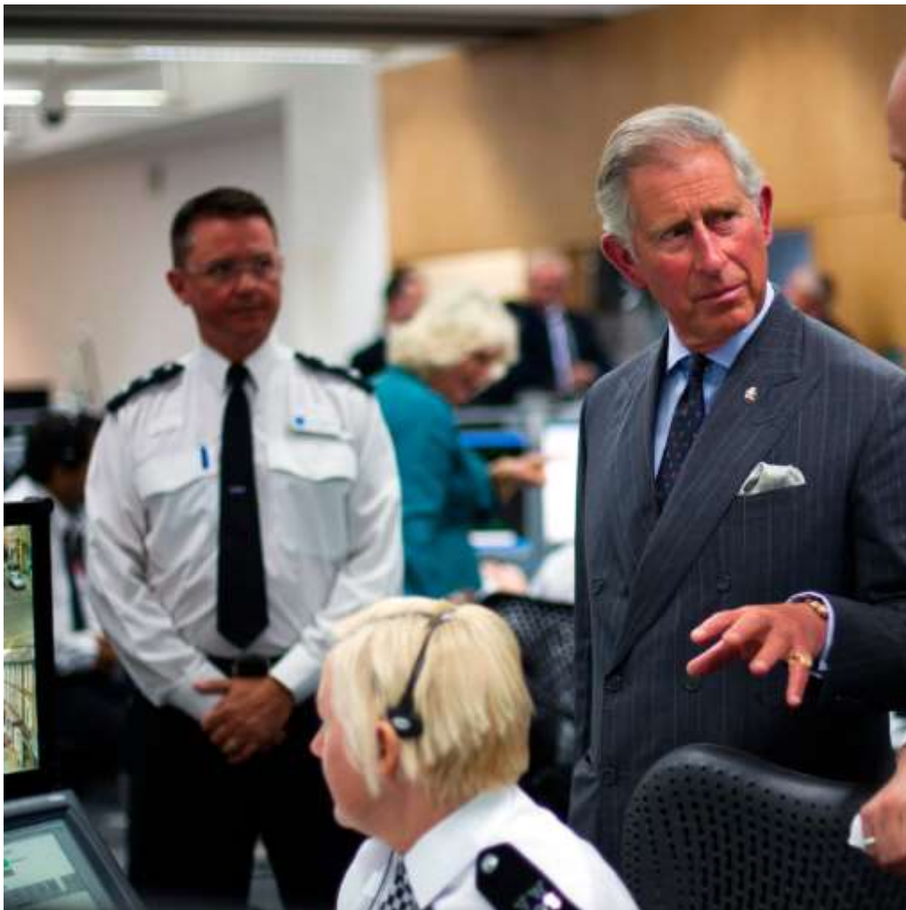
Then-Prince Charles visits the Metropolitan Police Central Communications Command during the 2011 London riots

In one message, the then-heir to the British throne openly warned a health minister that “ chickens will come home to roost ” in their department if redevelopment of a hospital – in which the Prince’s architecture charity had an interest – was not accelerated. However, Charles didn’t typically rely on threats. Government officials were usually willing to obsequiously roll over whenever – and however – he ordered them to.