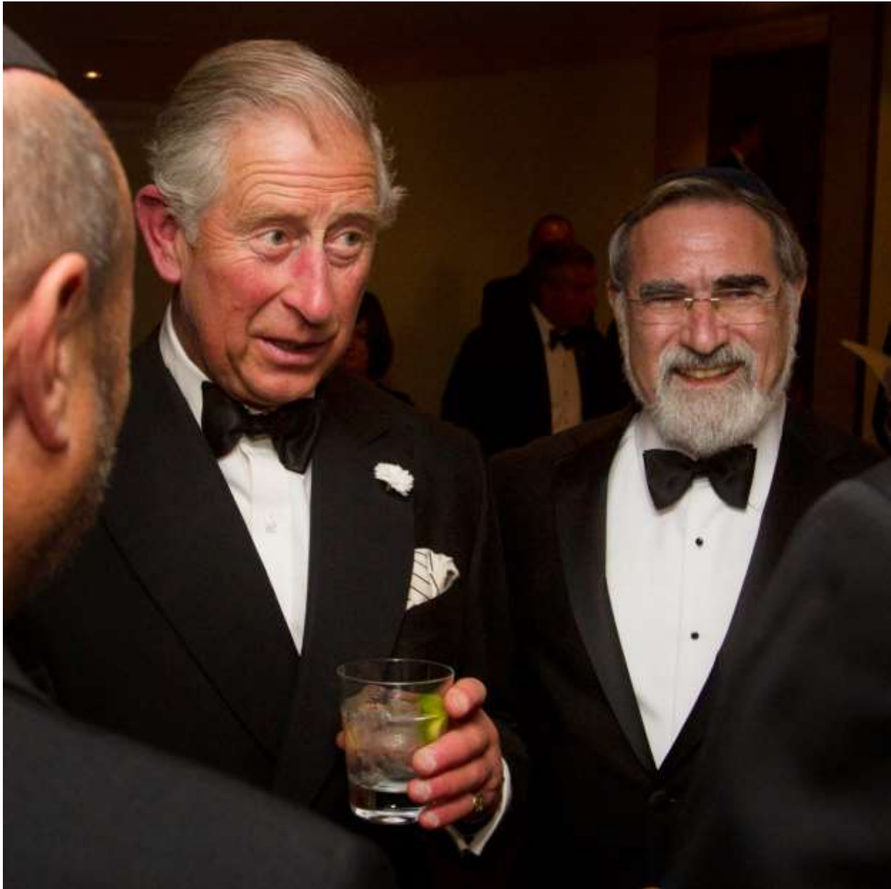
Then-Prince Charles speaks to guests during a tribute dinner to Lord Sacks, June 24, 2013. Lewis Whyld

At many of the countless demonstrations the world over in support of the Palestinians, demonstrators have brandished aloft signs imploring the U.S. President to impose a ceasefire in Gaza, if not order Netanyahu to seek enduring peace. Such requests may be misdirected. The true power to halt Israel's latest push to fulfill Zionism's genocidal founding mission may not lie in Washington, DC but in London. Specifically, Buckingham Palace.