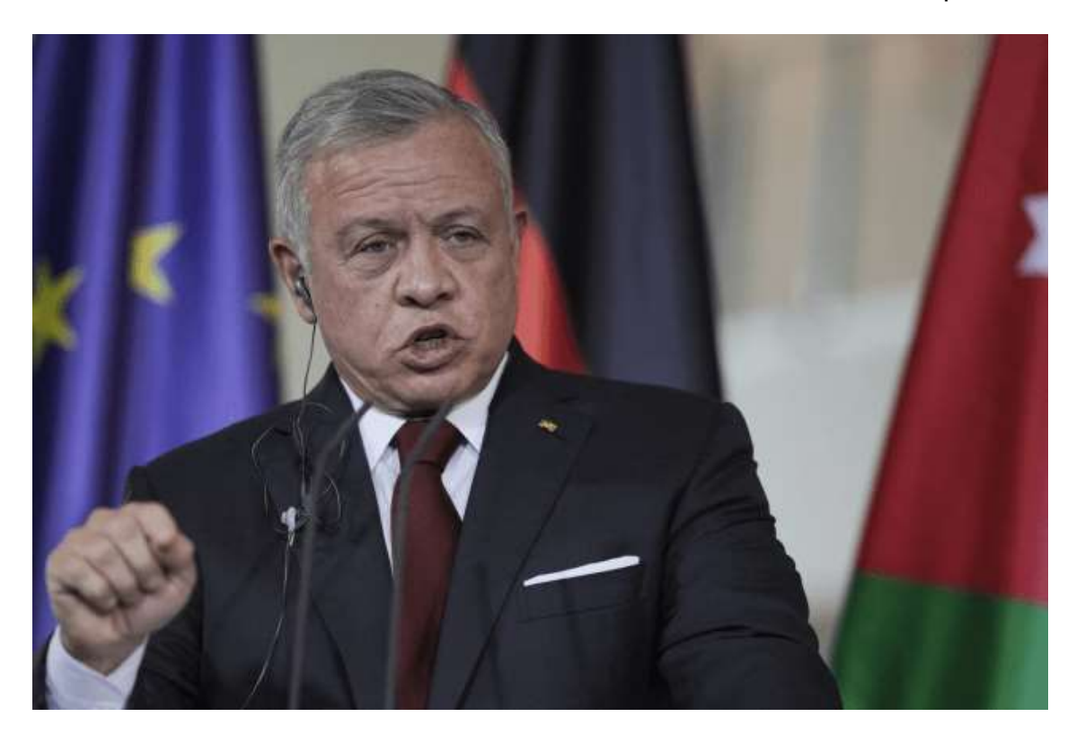
In the 1967 Mideast war, when Israel seized the West Bank and Gaza Strip, 300,000 more Palestinians fled, mostly into Jordan.

Displacement has been a major theme of Palestinian history. In the 1948 war around Israel's creation, an estimated 700,000 Palestinians were expelled or fled from what is now Israel. Palestinians refer to the event as the Nakba, Arabic for "catastrophe."