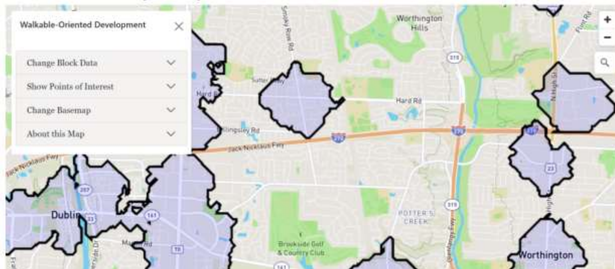
Walkable Oriented Development Map

As an example, I live in Columbus Ohio. Here is a map of my neighborhood. The gray areas are walkable areas. Although Sawmill Road (70) is shown as a walkable area, I have NEVER seen anyone walking on Sawmill Road. Traffic is congested and it is primarily a large, disconnected outdoor shopping mall). My neighborhood is on this map, but according to AEI is not walkable, yet I chose this neighborhood for its limited traffic and walkability. Go figure. I would purposefully avoid a walkable city, but then I like driving my ICE (internal combustion engine) car and riding my bike. Riding a bike on congested Sawmill Rd would be suicide.