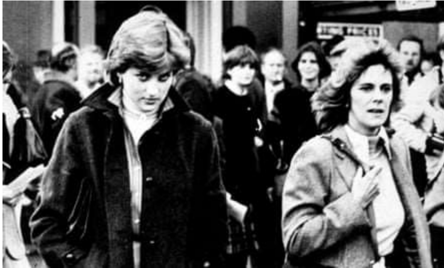
The then Lady Diana Spencer and Camilla Parker-Bowles at Ludlow Races in 1980.