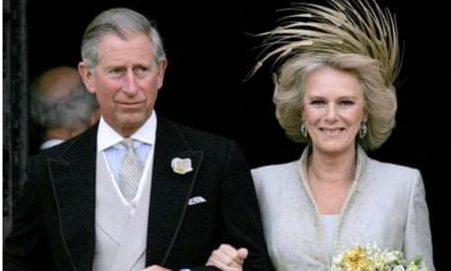
Prince Charles and Camilla.

57. Charles and Camilla’s wedding in 2005 clashed with the Grand National, which was therefore delayed by 25 minutes. Shortly after the ceremony, the Queen stepped into a side room at Windsor Castle to watch the race. She also left the reception to watch it again. Her wedding present for the couple was a broodmare.