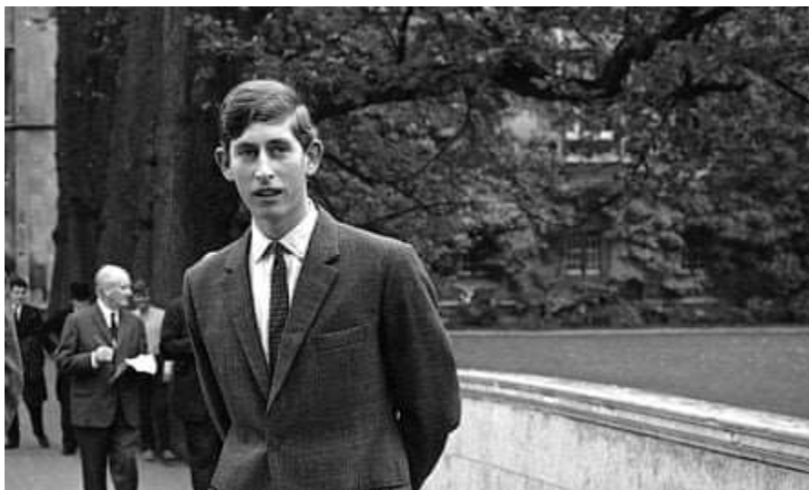
Prince Charles arrives at Trinity College, Cambridge, in 1967.

20. When he met Camilla Shand in the summer of 1971, she is said to have introduced herself by saying : “ My great-grandmother was the mistress of your great-grandfather – so how about it? ”