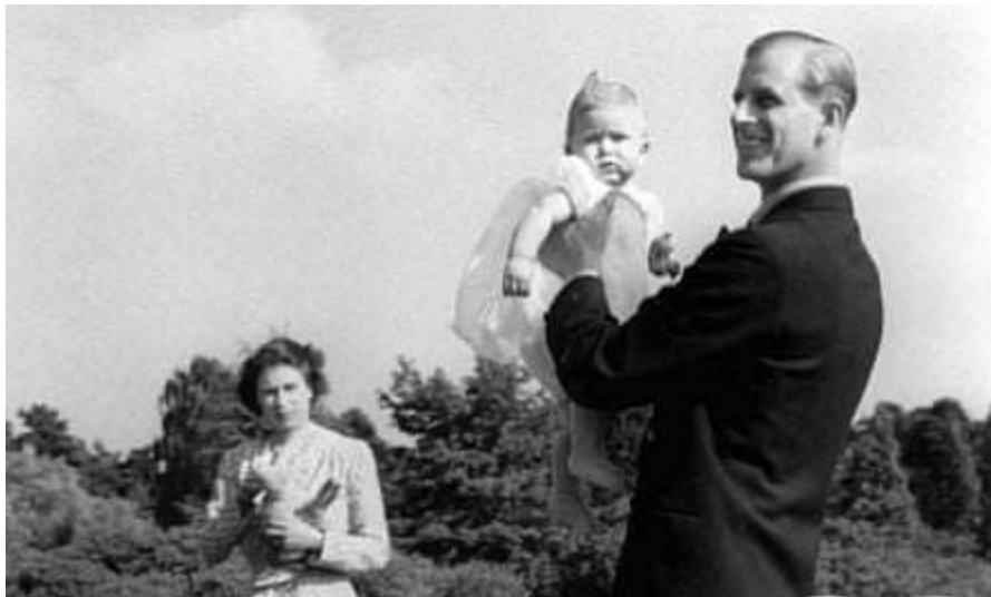
Prince Charles is held up by his father, Prince Philip, in 1949.

2. Philip was not present, and at one point, went to play squash. He is said to have declared that his son looked like a plum pudding .