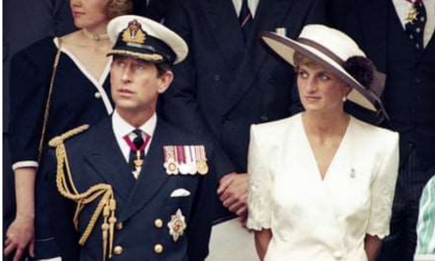
Charles and Diana in 1991.

41. Andrew Morton's book, published in 1992, revealed excruciating details of the breakdown of Charles and Diana's marriage. They separated formally later that year. In 1993, a recording of a conversation between Charles and Camilla, in which he said he would like to be reincarnated as her tampon, caused a sensation. An Italian newspaper referred to Charles as "Il Tampaccino" when reporting the story.