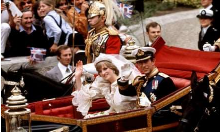
Charles and Diana head to the palace after their wedding.

36. Charles's belief in unproven treatments was attributed to the man he was said to view as his spiritual mentor, Laurens van der Post, who was later disgraced by the revelation that he had fathered a child with a 14-year-old girl when he was 46. Van der Post persuaded Charles to record his descriptions of his dreams, which were then subjected to Jungian analysis.