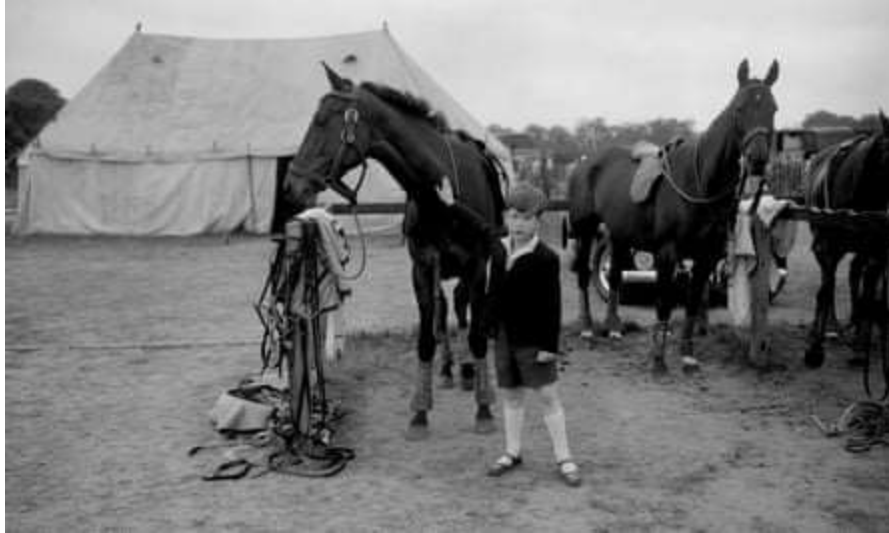
Prince Charles in the summer of 1956.

13. Charles was then sent to Gordonstoun School, where, at age 14, a trip on the “school yacht” to the Isle of Lewis led to him and a group of other boys taking refuge from tourists in a bar. He was seen ordering a cherry brandy by a tabloid journalist . His personal security officer was fired by the Metropolitan police as a result.