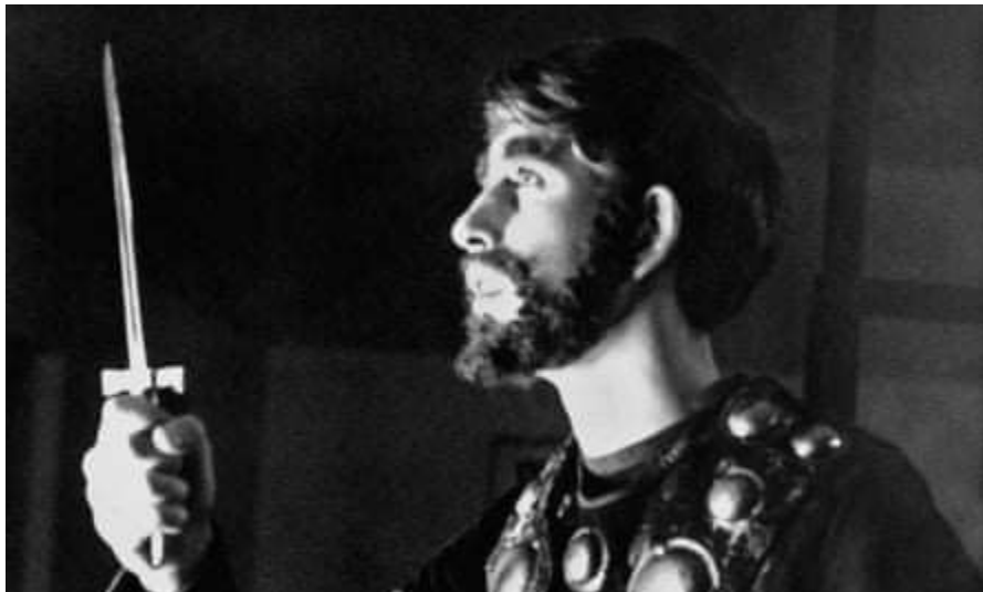
Charles as Macbeth.

14. At Gordonstoun, Charles was ostracized by his fellow pupils, who made “slurping” noises at anyone who was friendly to him. He wrote in a letter home : “It’s such hell here, especially at night ... The people in my dormitory are foul. They throw slippers all night or hit me with pillows or rush across the room and hit me as hard as they can, then beetle back again.” He reportedly later referred to the school as “a prison sentence” and “Colditz in kilts”.