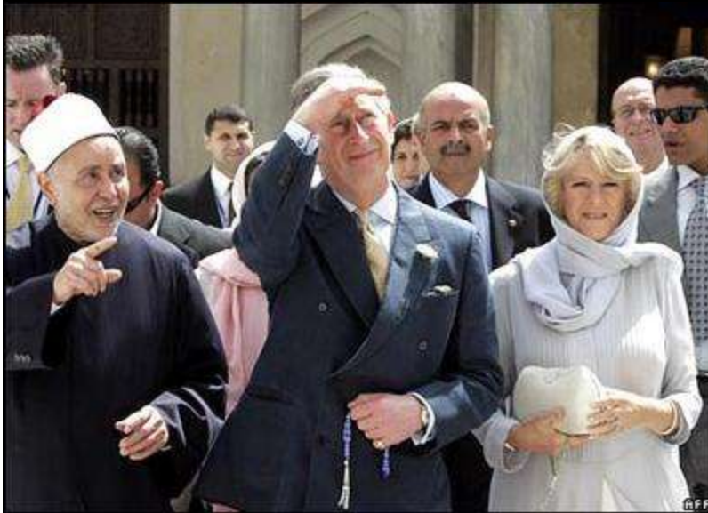
Charles with worry beads, Camilla with shawl.

None of this, of course, is evidence that the Heir to the British Throne has changed religions, but his actions most certainly would be consistent with such a move, and especially the implication that he had kept the Ramadan fast.