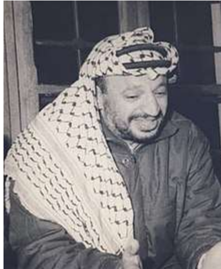
Yasser Arafat in his iconic fishnet pattern keffiyeh , 1974

traditional tarbush hats with the keffiyeh . The move was intended to create unity, as well as allow the rebels to blend in when they entered the cities.