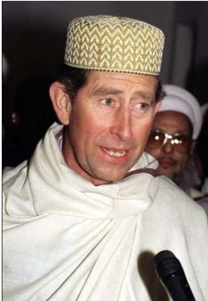
Prince Charles, a would-be Muslim?

secret convert to Islam. They sifted through his public statements (defending Islamic law, praising the status of Muslim women, seeing in Islam a solution for Britain's ailments) and actions (setting up a panel of twelve "wise men" to advise him on Islamic religion and culture), then concluded that, "should Charles persist in his admiration of Islam and defamation of his own culture," his accession to the throne will indeed usher in a "different kind of monarchy."